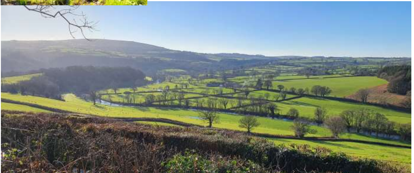
View of the Tamar Valley just south of Horsebridge

When you reach the road in Horsebridge turn right to walk back to your car or the pub.