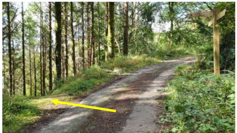
Stay on the track through a gate which is sometimes closed. About 100m further on a signpost on the right shows two ways to Morwell Rock and Morwellham we want the walkers route so here turn left.