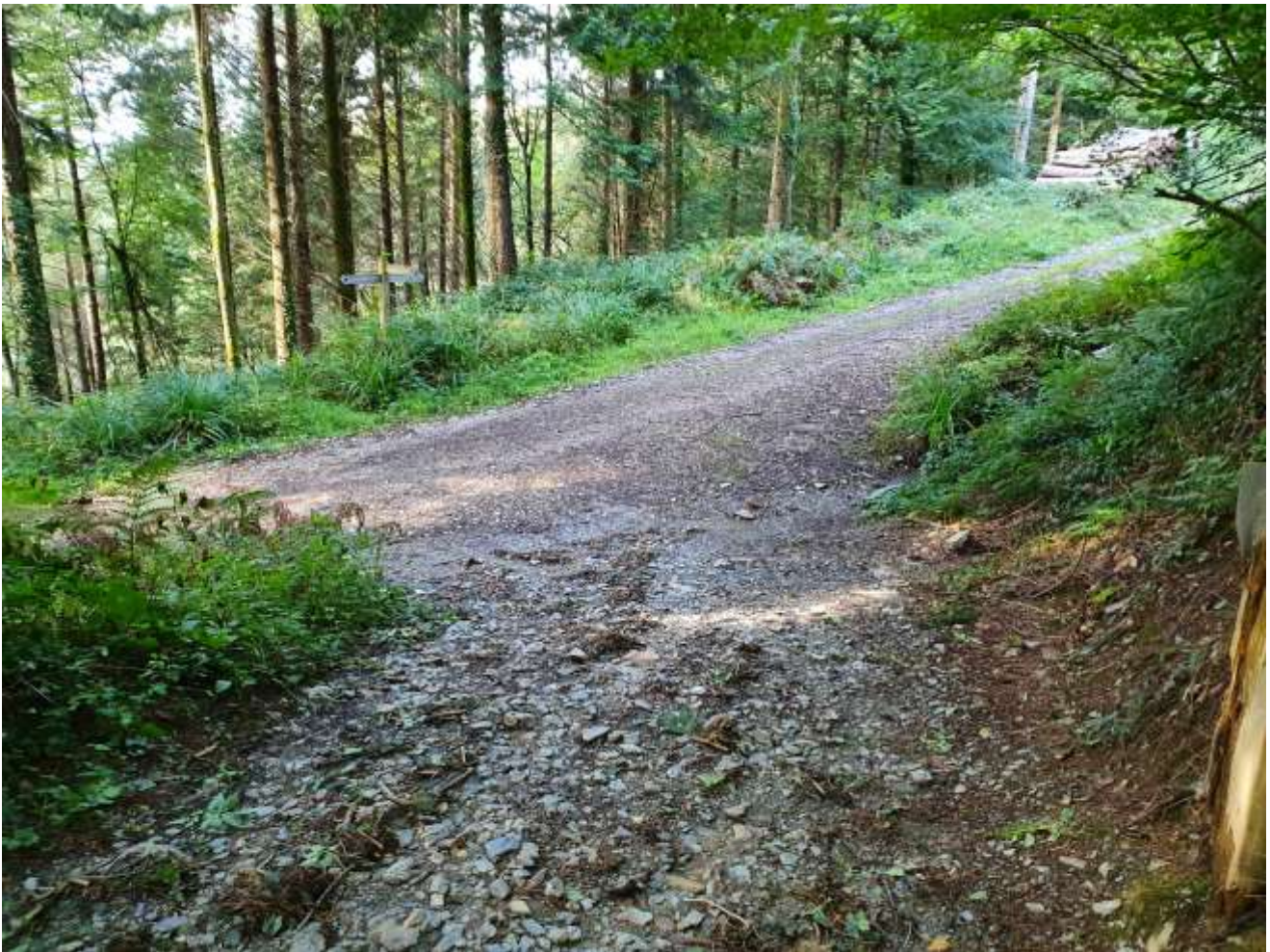
When you reach the wider track turn right and follow the sign to Morwell Rocks and Morwellham