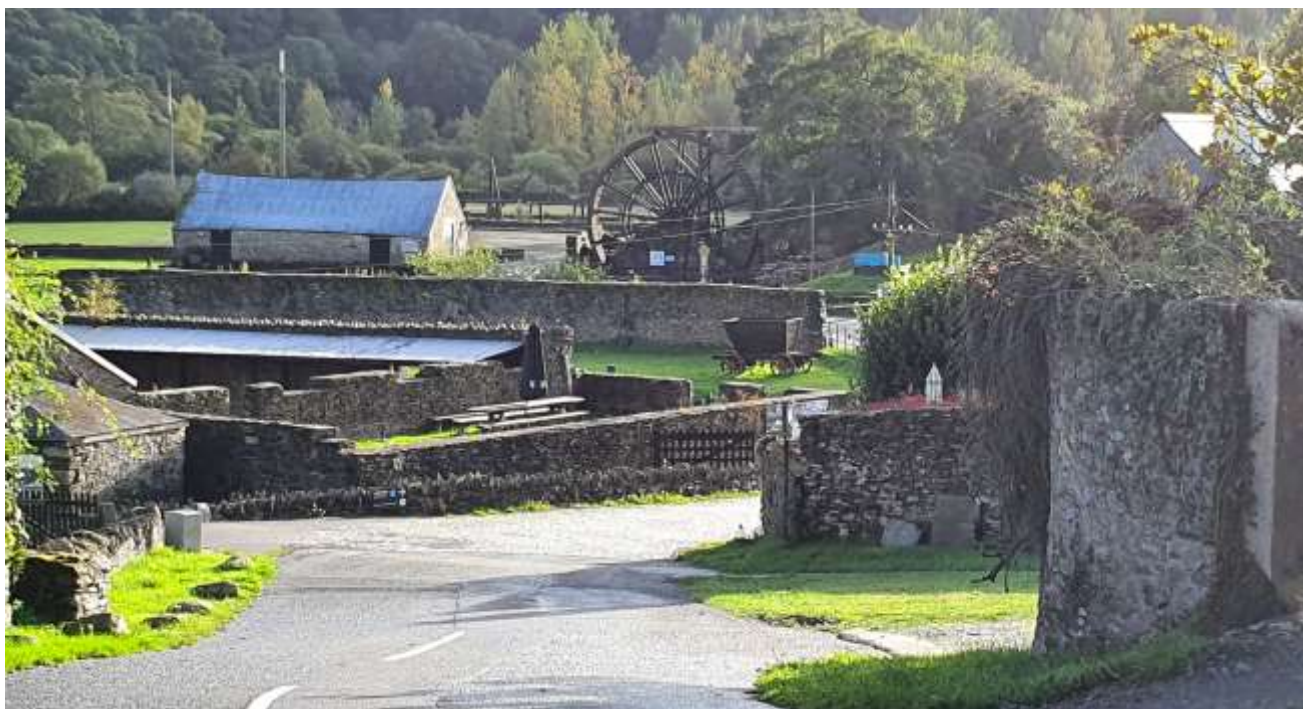
The photo is of Morwellham quay which you will pass through.

Starting out from Maddacleave car park walk back out of the of the car park and go straight across the access road.