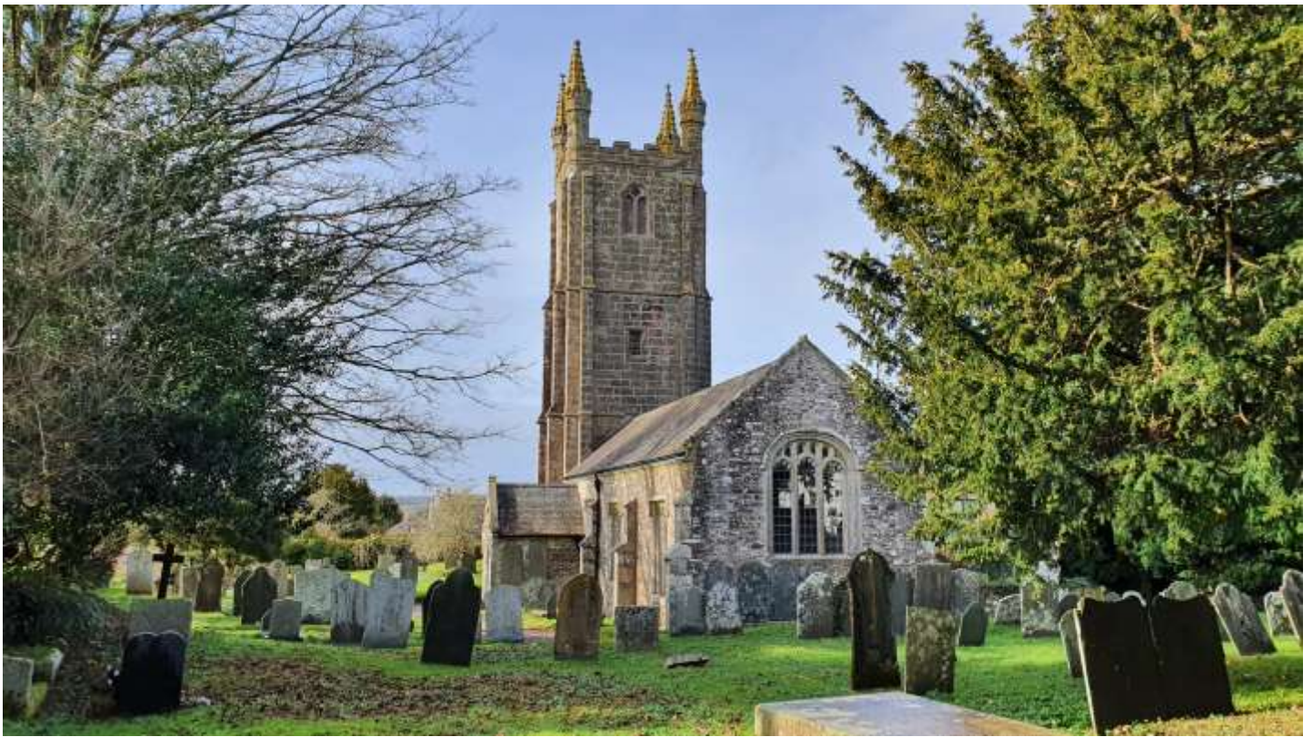
Sydenham Damerel church

The walk starts at the little Scrubtor car park PL19 8PE, SX414743 that primarily provides access to the north end of the Tamar Trails however our walk goes in the opposite direction.