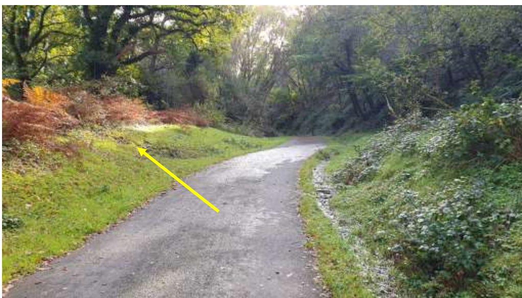
Having gone over Gem bridge and a just past a wall of railway sleepers on your right fork left. ( If you find you have reached a bridge you need to be on it not under it)