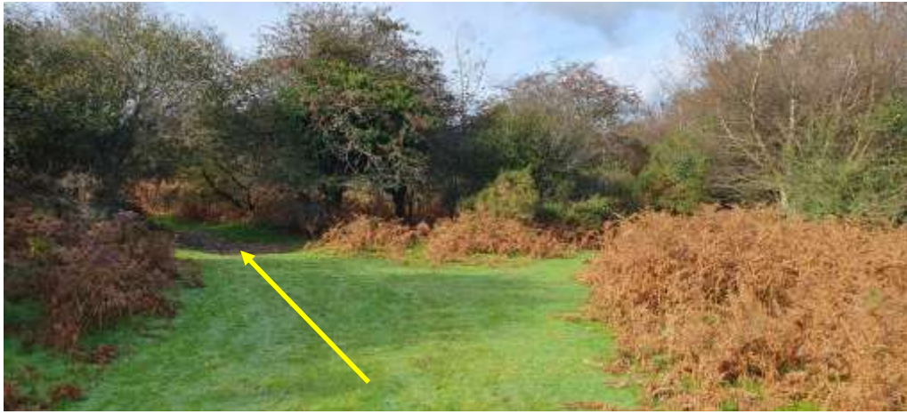
After a couple of hundred yards fork left