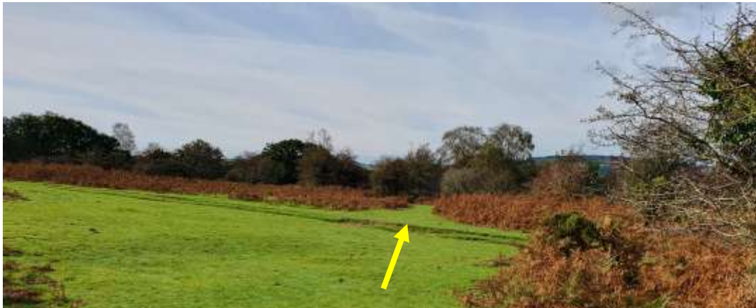
Quite quickly meeting another crossroads of grassy tracks. Here go straight across and stay on this track until you meet a road.