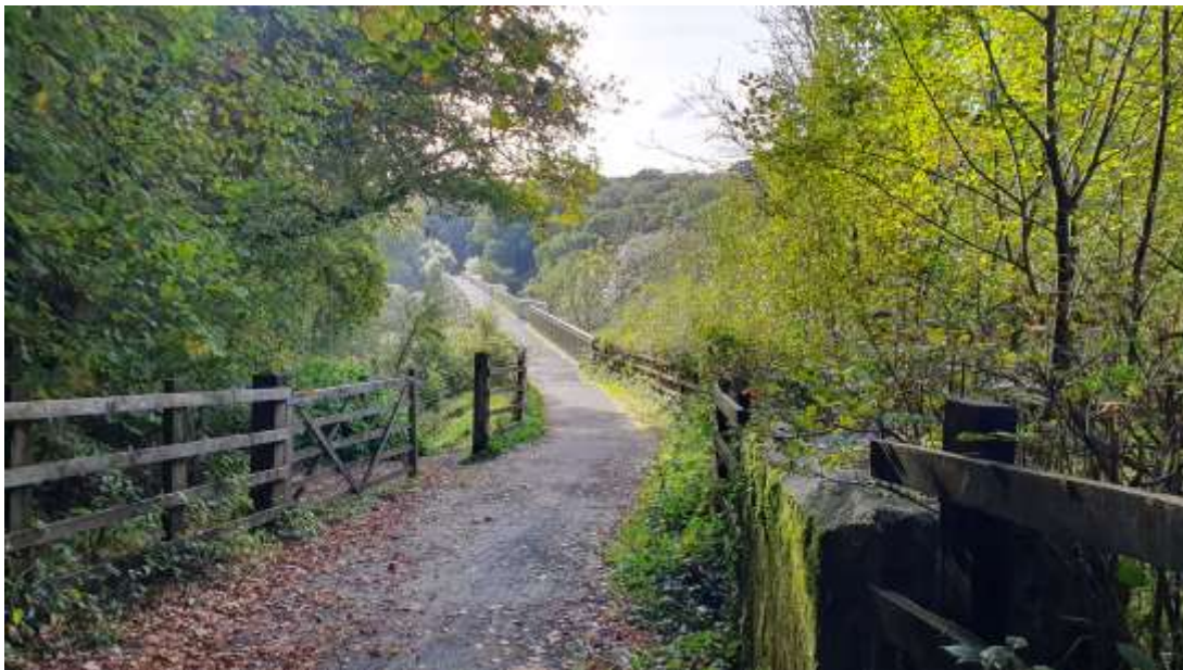
And then over Gem bridge built in 2012