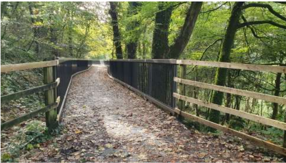
Over a raised board walk that was rebuilt in 2023