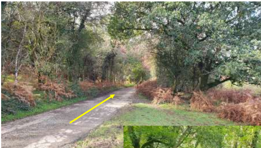
Turn right and walk down the hill. The tarmac road ends at a house but keep going on the now un-made up slightly muddy track.