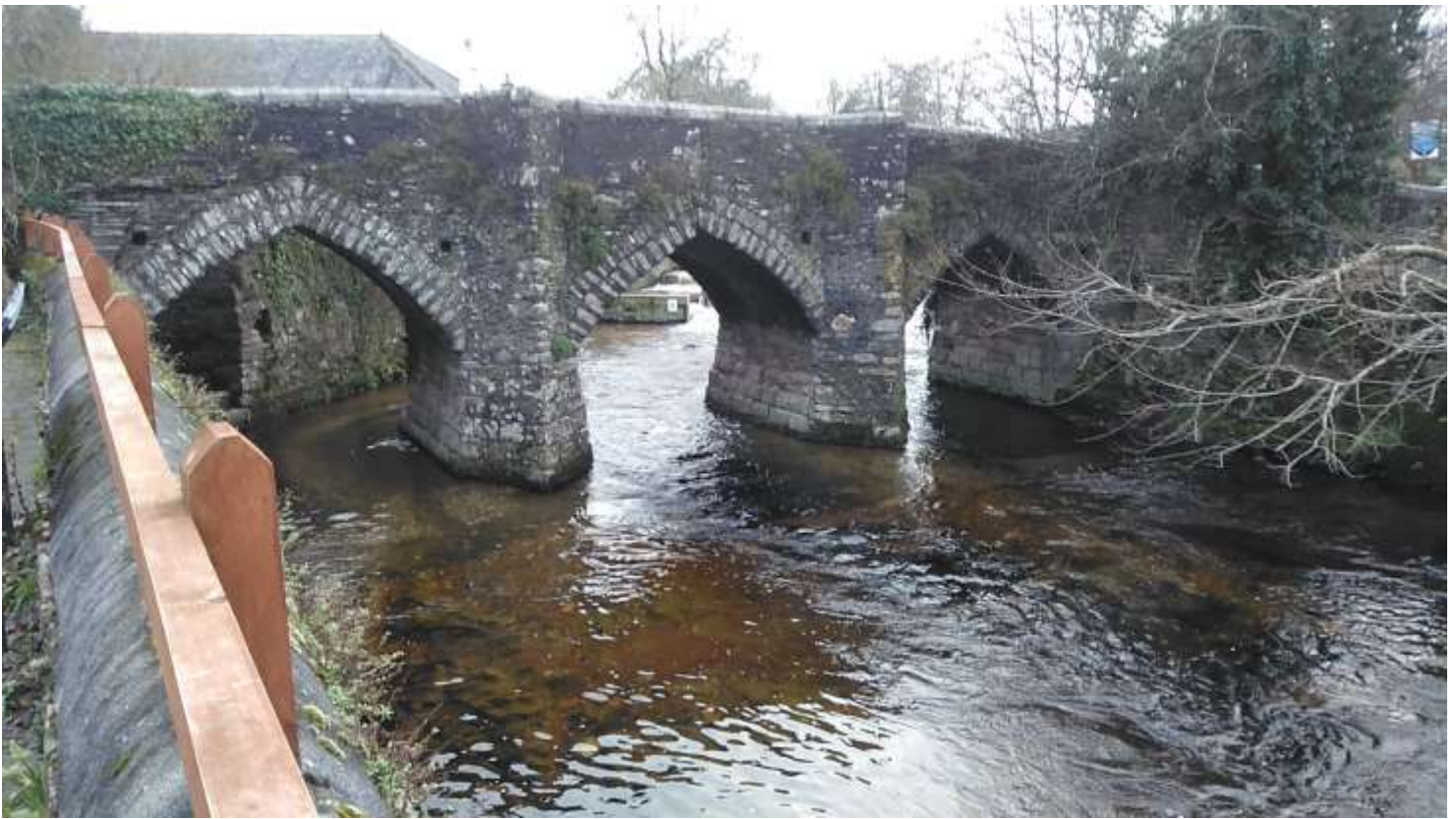
Horrabridge bridge a 14th century grade 1 listed bridge