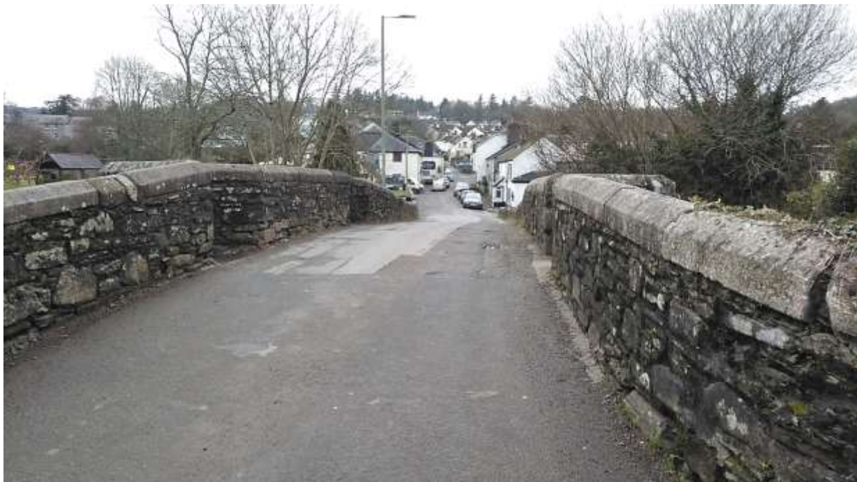
Cross over the bridge and walk back to your car.