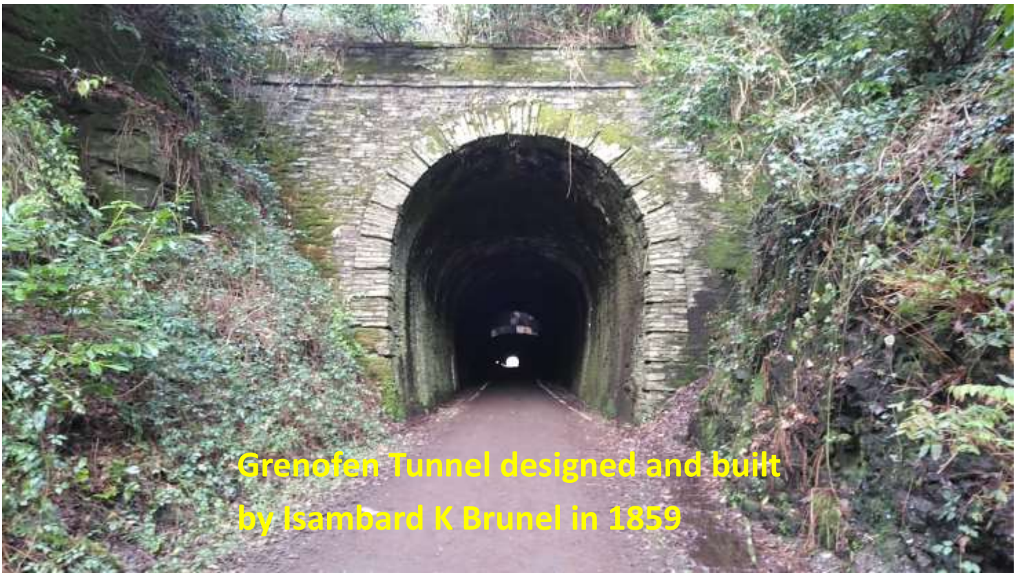
Grenofen Tunnel designed and built by Isambard K Brunel in 1859

Keep on the right through the tunnel. You may need an umbrella and keep a look out for cyclists.