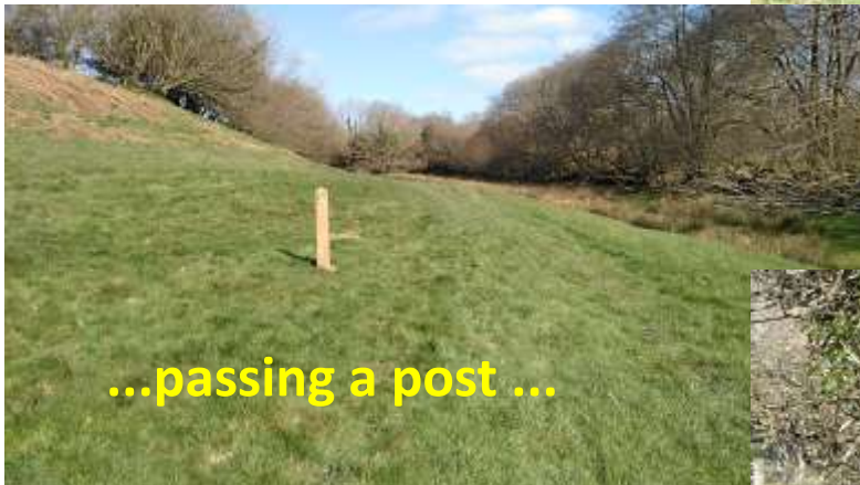
...passing a post ...