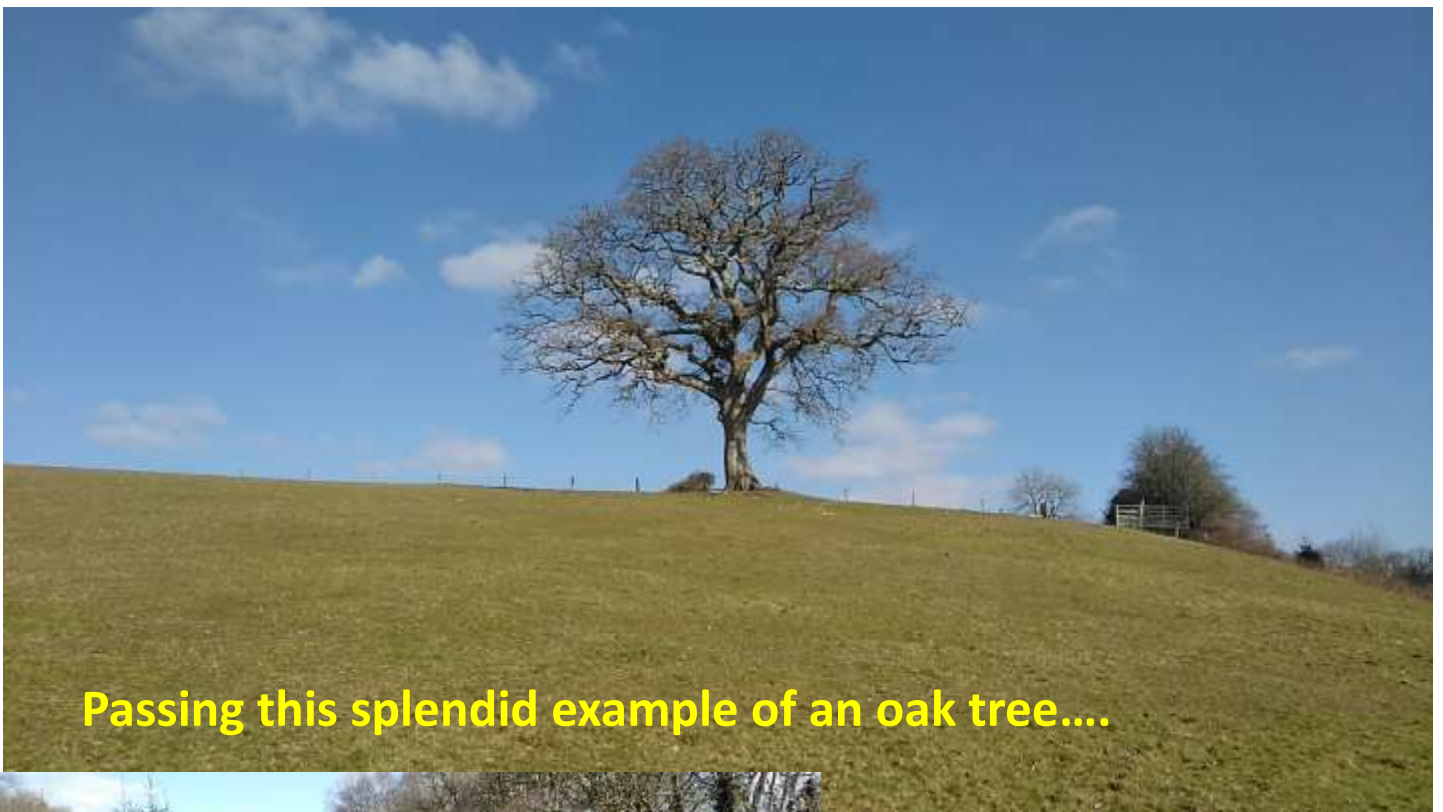
Passing this splendid example of an oak tree....