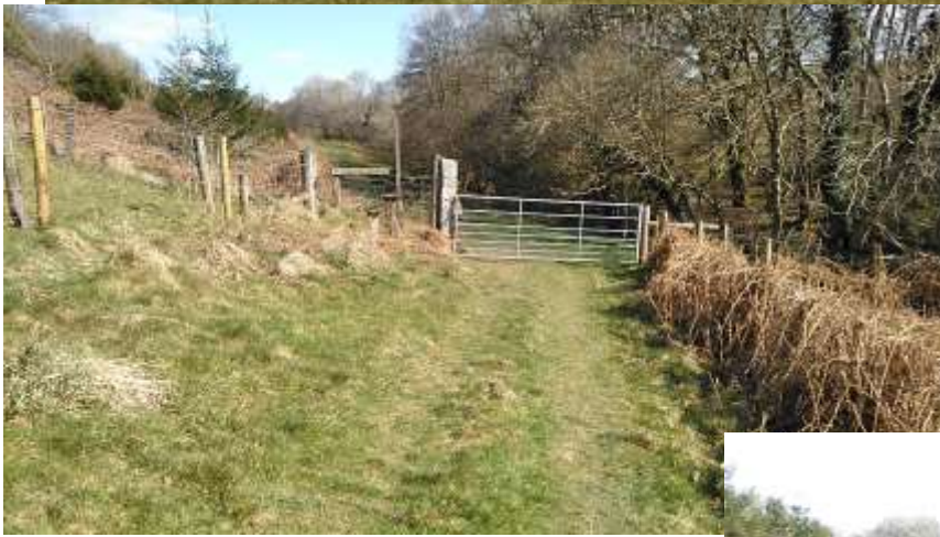
...go through a gate.....