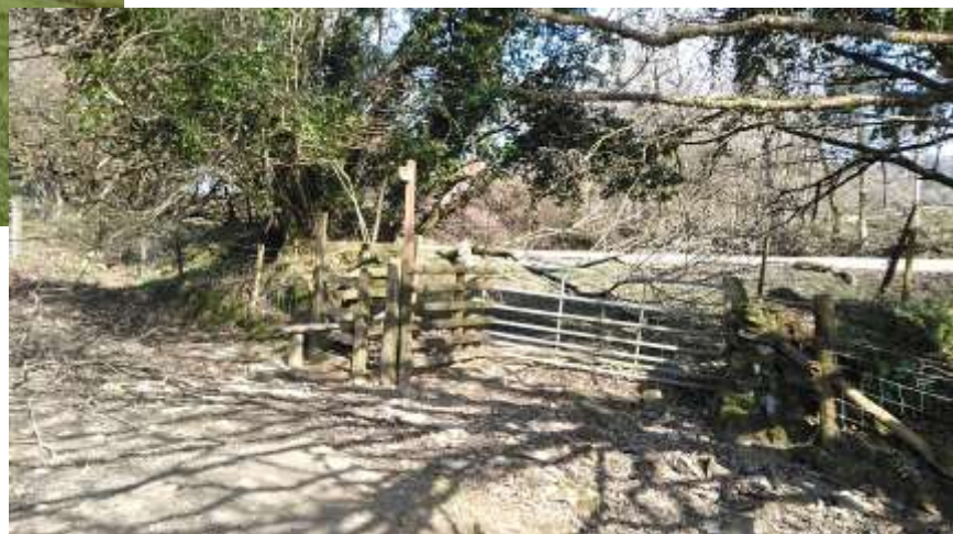
... and when you reach the road turn right. (This tall stile has no dog gate )