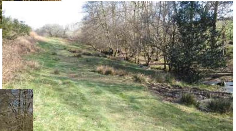
Along the bank of a stream and over a stile....