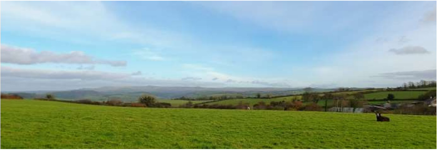
Views on a sunny day