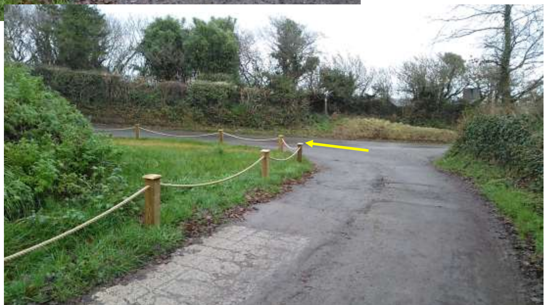
..and on reaching the road junction turn left to walk up the road but only for 120m.