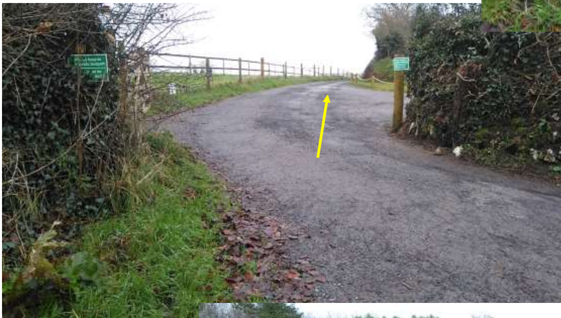
... out on to a private drive passing some stables ...