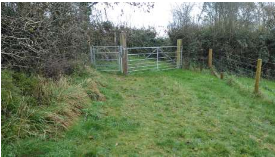
Through a gate and between two tall hedges.....