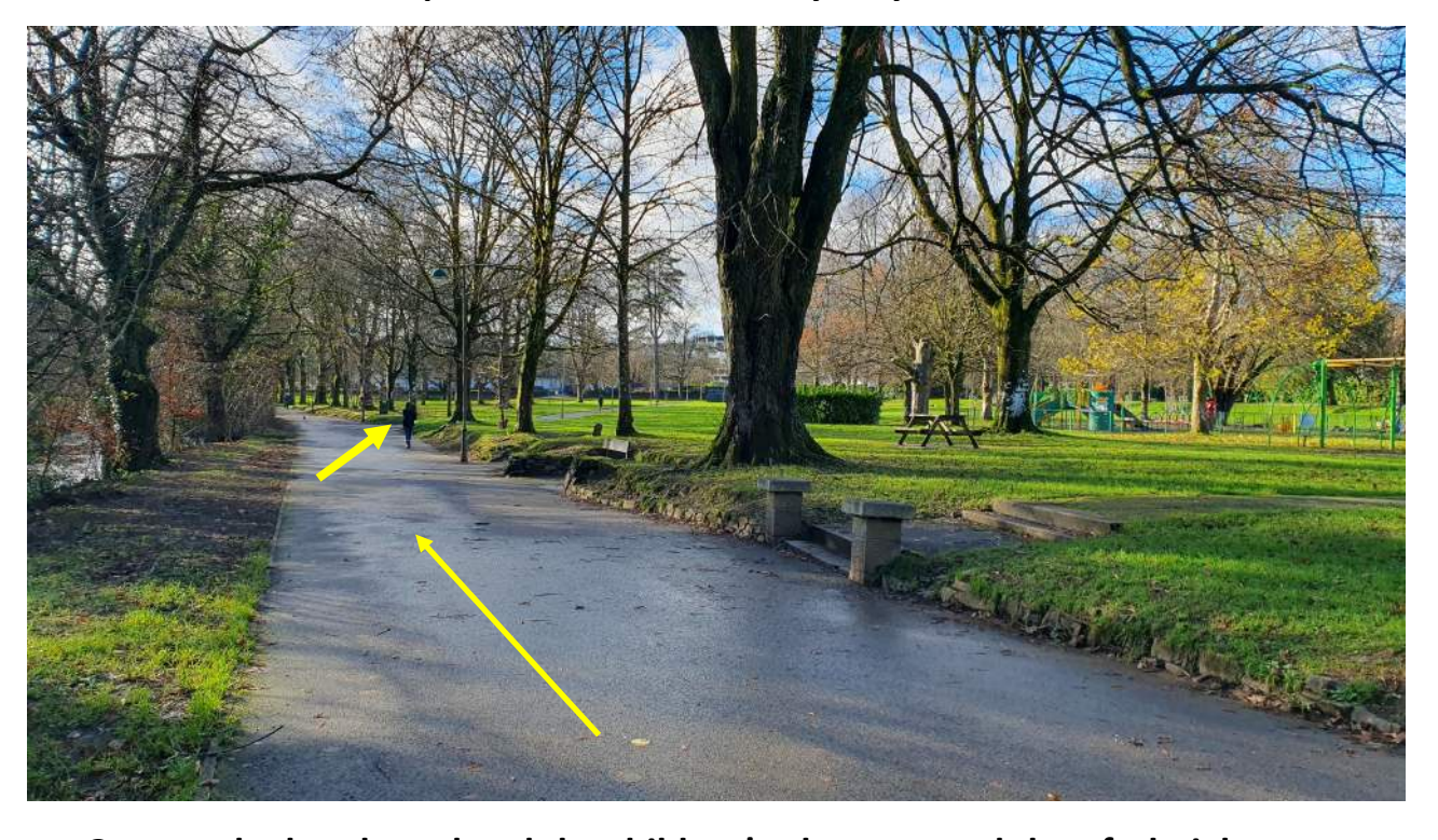
Go past the bandstand and the children's play area and then fork right across the meadow