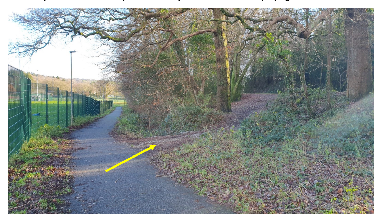
On reaching the school playing field fork right off the tarmac path and up to the canal tow path