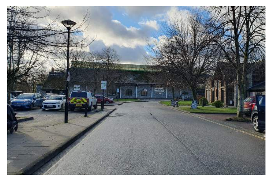
Set off towards the Meadowlands swimming pool and as you reach it follow the road around to the left and then go right otherwise you will end up in the river. Then follow the riverside path with the River Tavy on your left.

The route starts in the Meadowlands car Park opposite the Wharf Theatre and takes you firstly beside the River Tavy and then for about a mile and a half next to the Tavistock canal