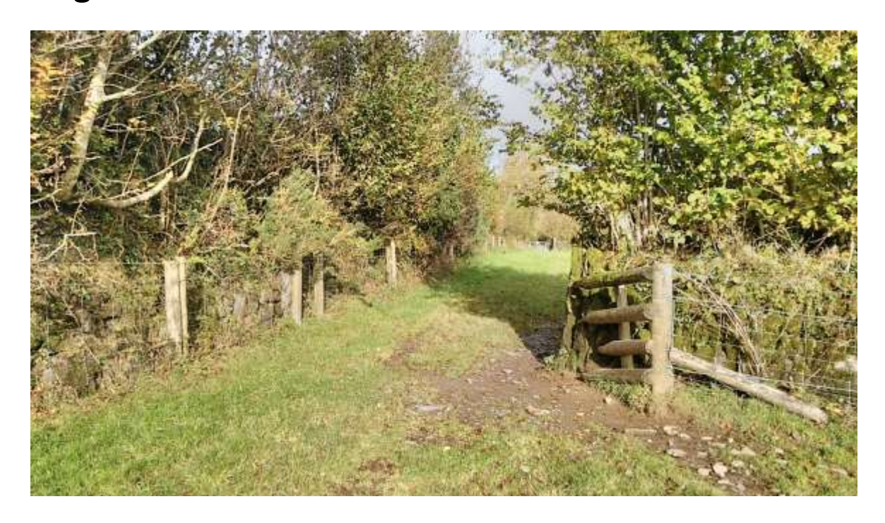
and then keep straight on with the hedge on your left.

and through another opening in a corner of this field where you will find a now disused kissing gate. Keep straight on to the top left hand corner of the next field to reach the next field gate.