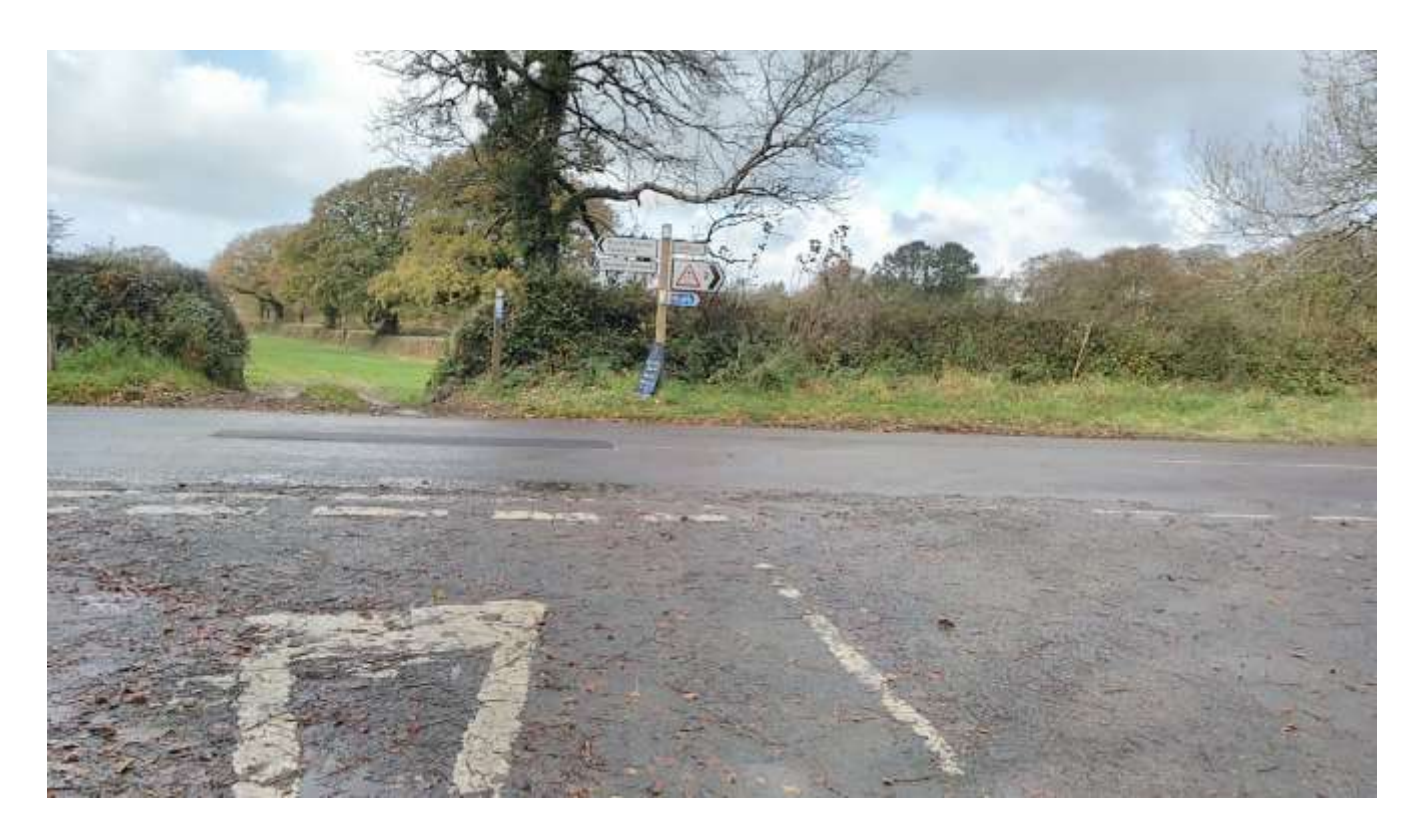
At the end of the road there is a T junction with a much busier wider road. Here turn right still following the route 27 signs.