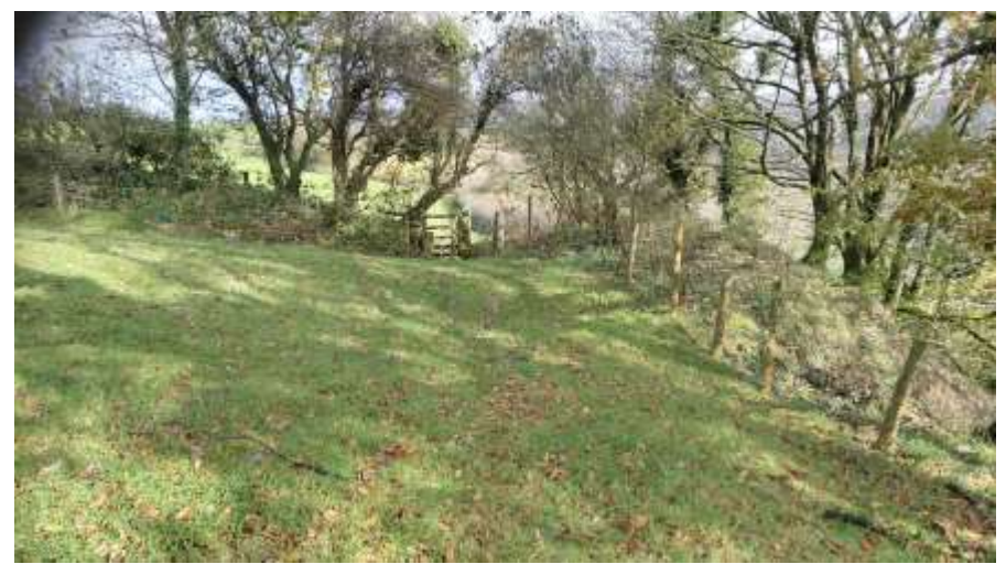
and here it is