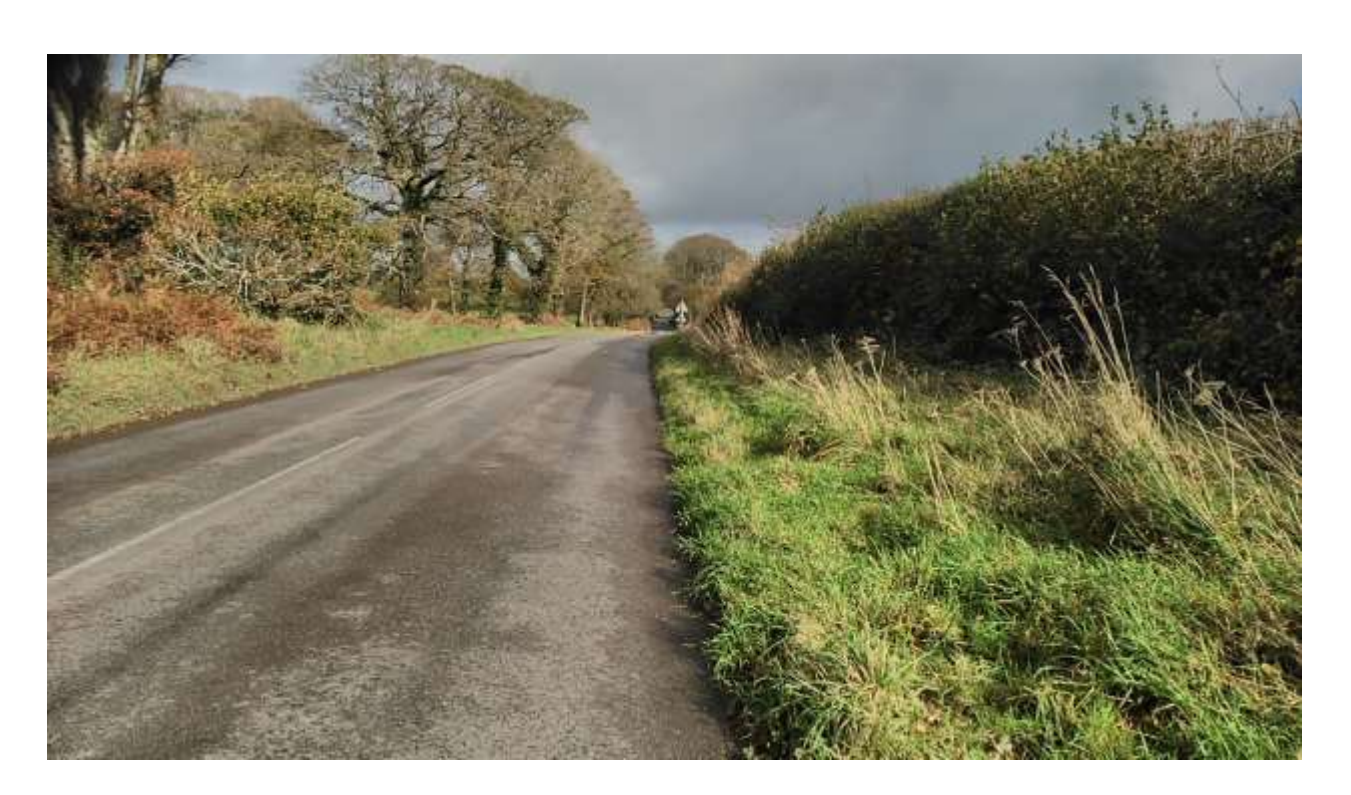
There is a nice wide verge you can walk on.