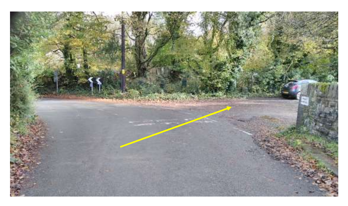
On the other side of the bridge turn right and staying on the bridleway walk on up to the moor gate