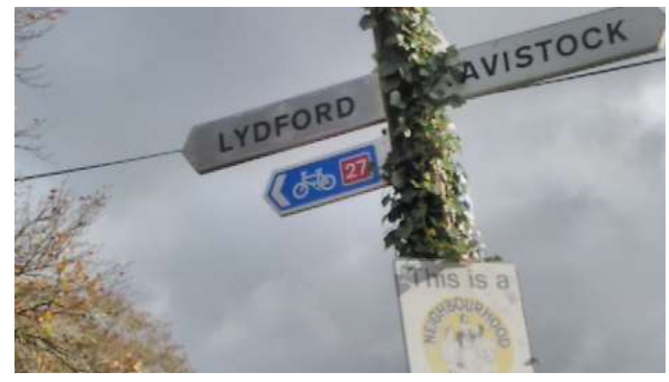
We are heading towards Lydford on route 27