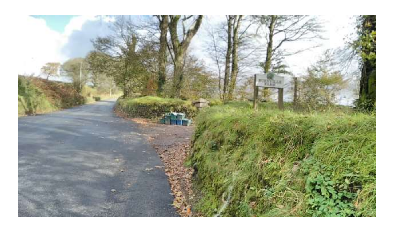
300m from the T junction you reach the entrance to Burnville Farm. Here turn right and walk up their long drive .

Go past the house and farm buildings then out into a field via the gate on your right ahead of you