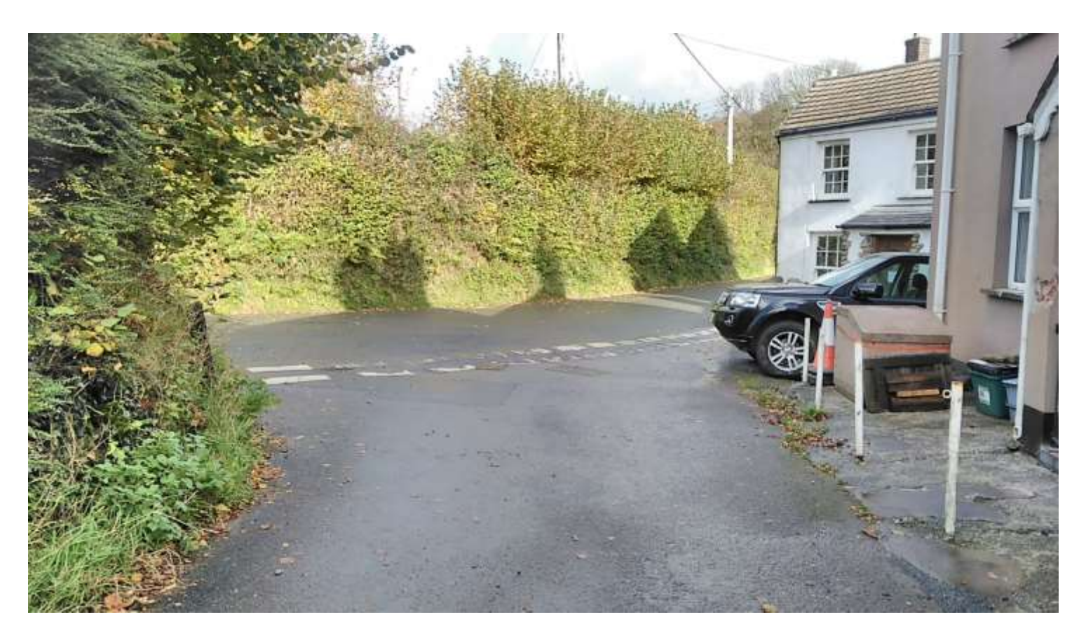
At the junction turn right