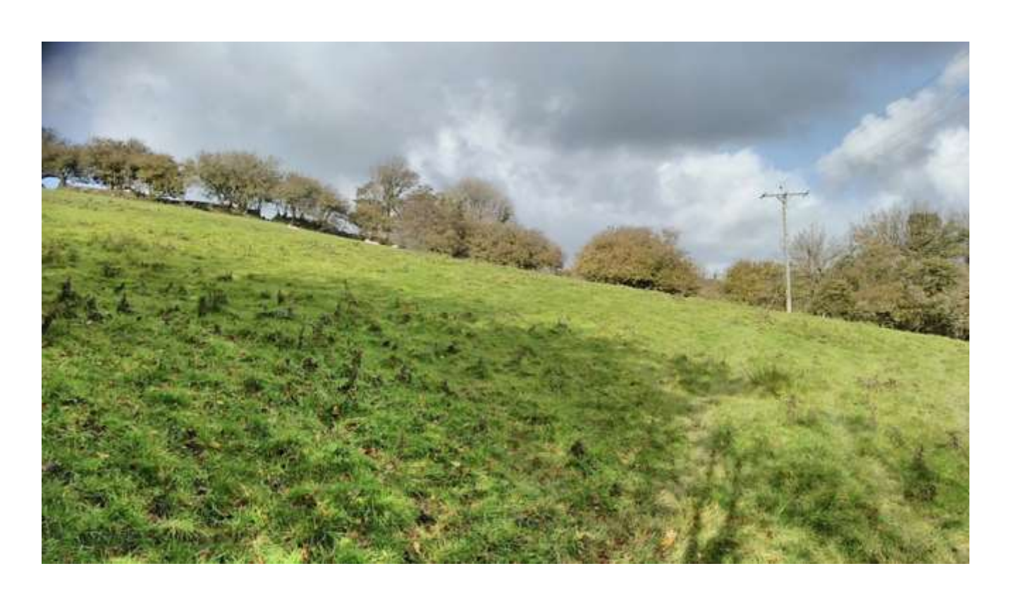
Having gone through the gate into the next field fork left a bit and pass well left of the telegraph pole.