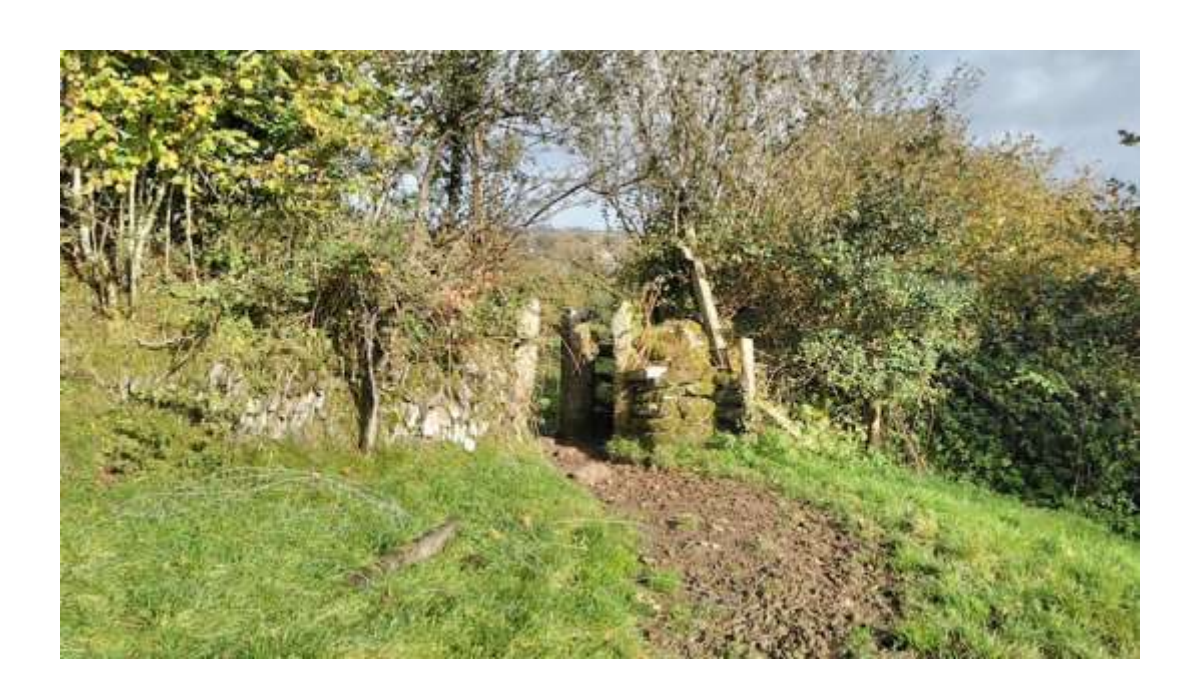
and through the gateway