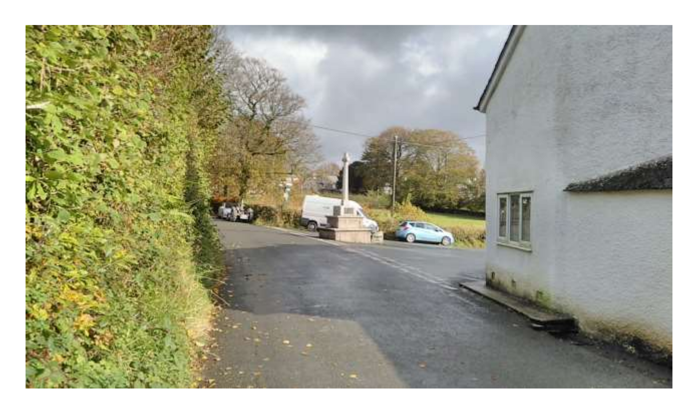
and when you reach the War Memorial keep left