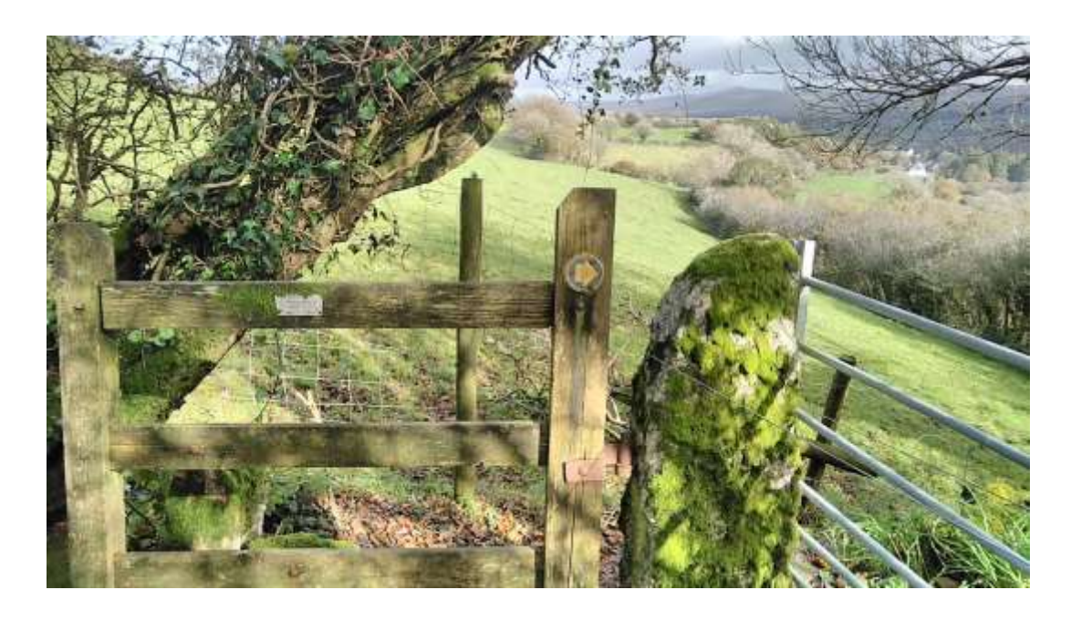
.....which ends at this gate. Here turn right and go down the steps

and long the path with some deer fencing on your right