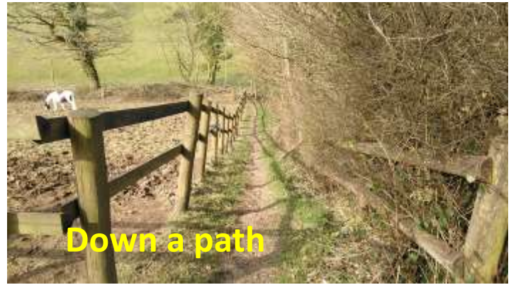
Down a path