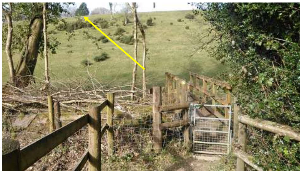
And finally across a bridge and up the steep slope on the other side heading for the pine tree