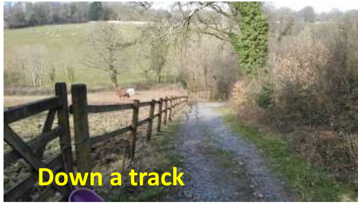
Down a track