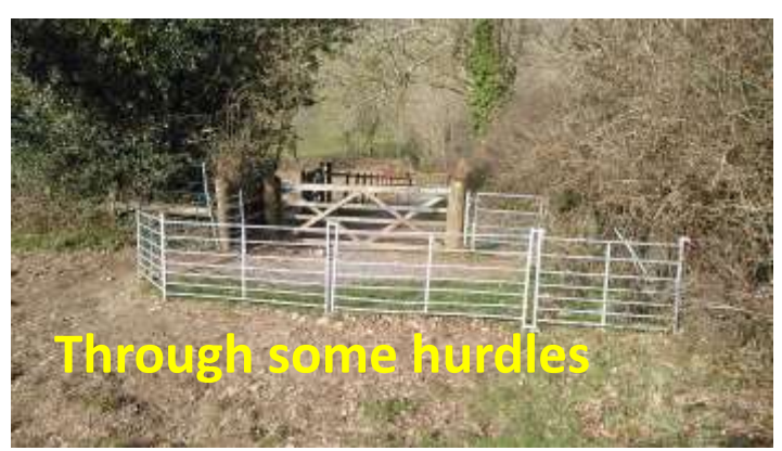
Through some hurdles