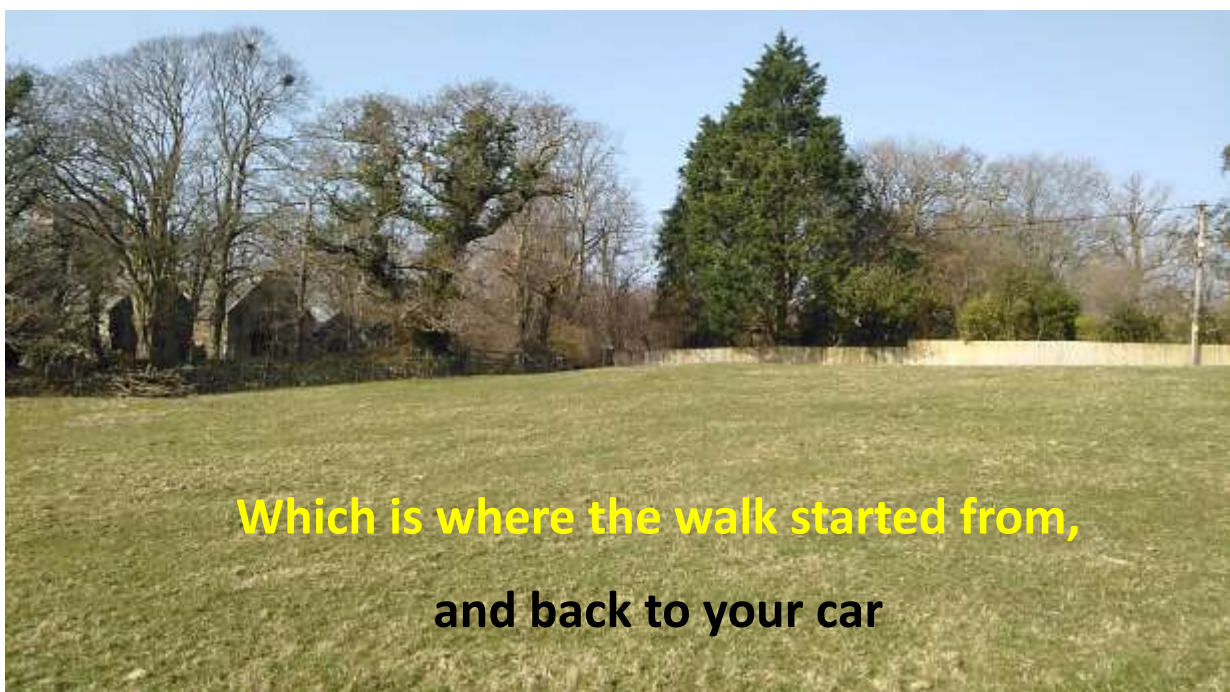
Which is where the walk started from, and back to your car