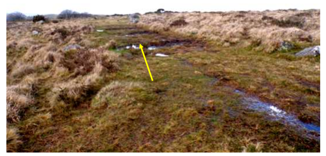
Then a little further on when you meet this wider track go left.