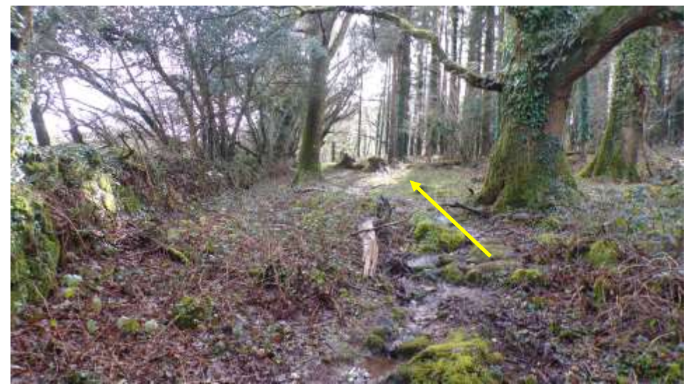
The path follows the edge of the wood

Go over the stile and turn left to follow the finger post sign to Loverton.