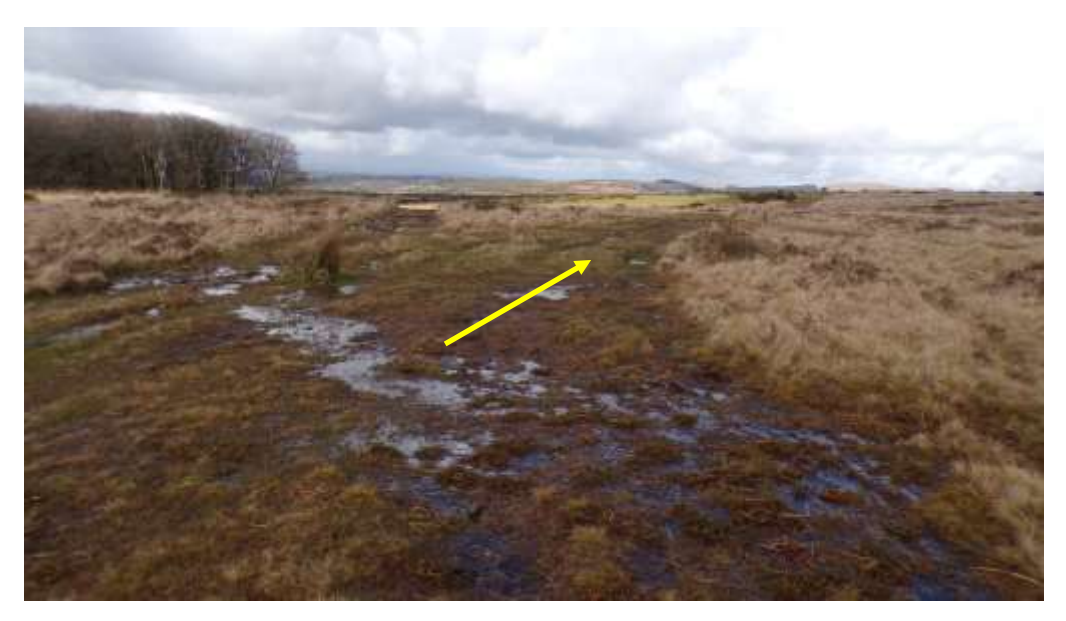
Keep right as you go past Briseworthy Plantation