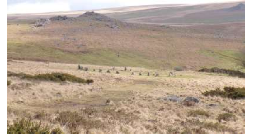
Having gone around the gorse patch walk on down to the stone circle.

Briseworthy Stone Circle is about 200m away next to the fence line on the other side of the dense patch of gorse in front of you which you now have to go around by forking left away from the fence line.