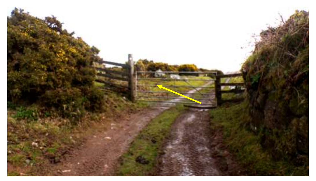
Go through the moor gate and immediately fork left