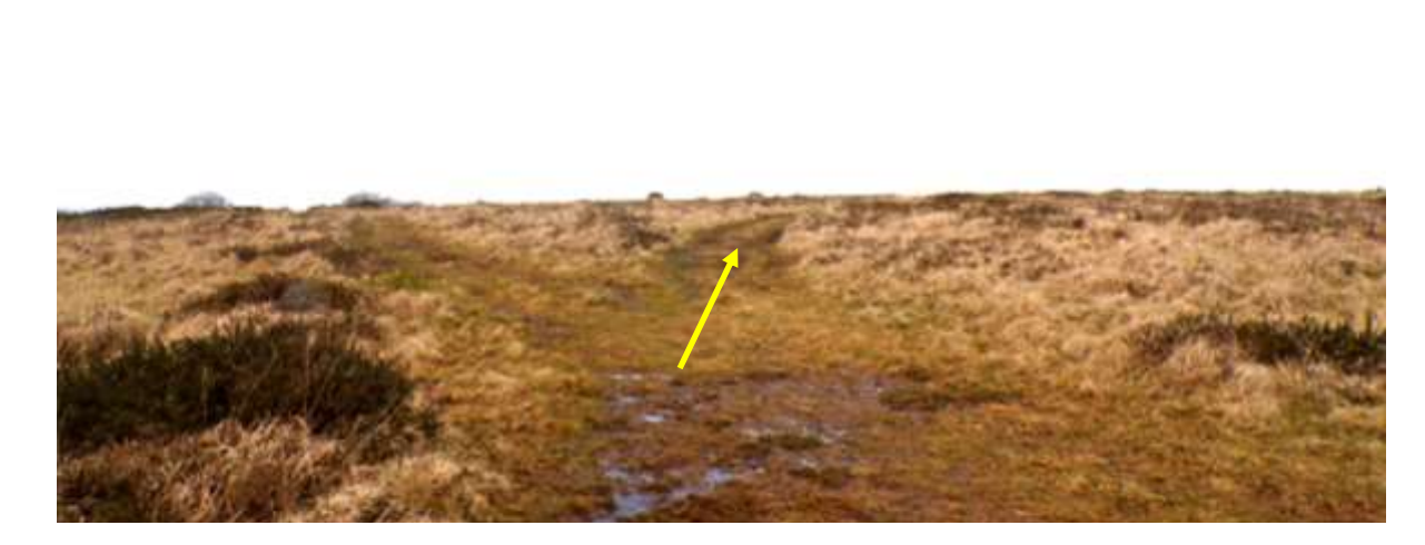
At the first Y junction keep right