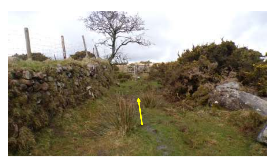
Go over the stile and up on to Ringmore Down and fork right.

Ignore the vehicle tracks and keep following the stone wall around to the left