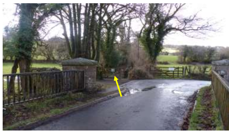
Go over the river Meavy and bear left onto a narrow sunken lane.

Start in the village of Meavy by setting off back towards Yelverton and at the first junction on the very edge of the village turn left.