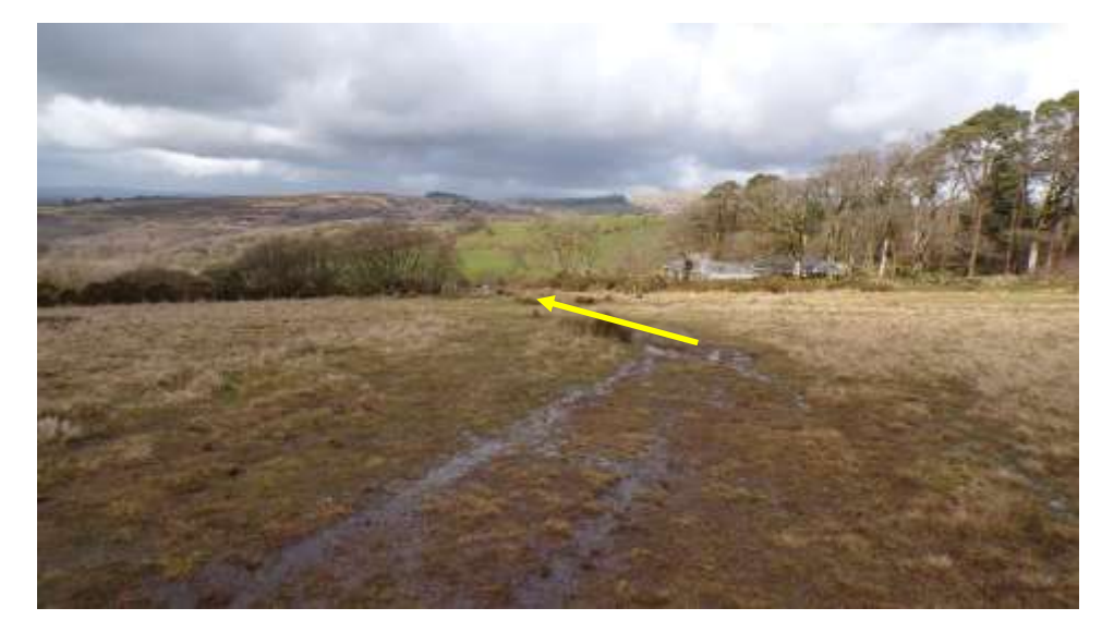
In about 10 minutes when Ringmore Cottage comes into view walk on down to it.

Keep following the wide grassy track without turning left or right.