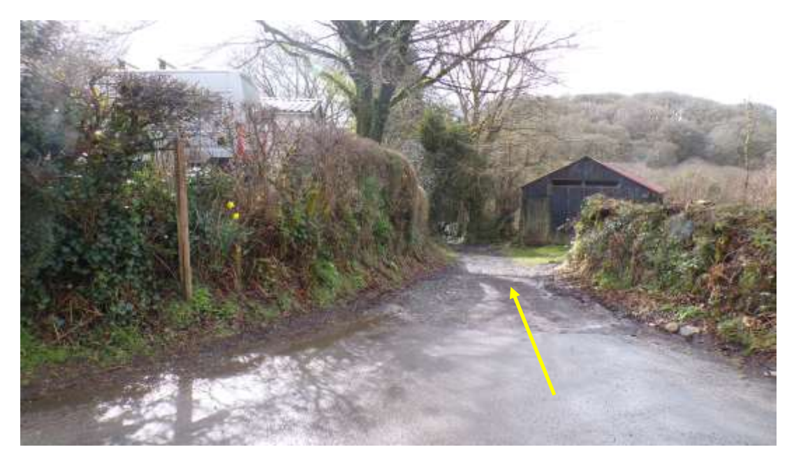
After about 100m bear around to the right ...