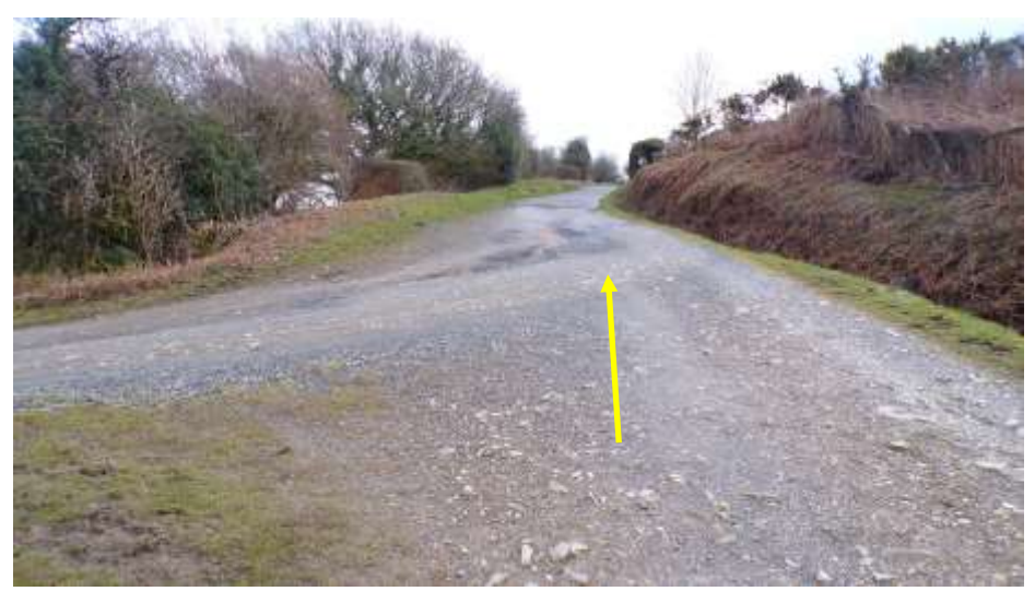
When you meet the track going downhill keep going uphill.

When you reach Durance farm go left between the two stone walls by the barn then in the farm yard turn right and walk up the access drive.