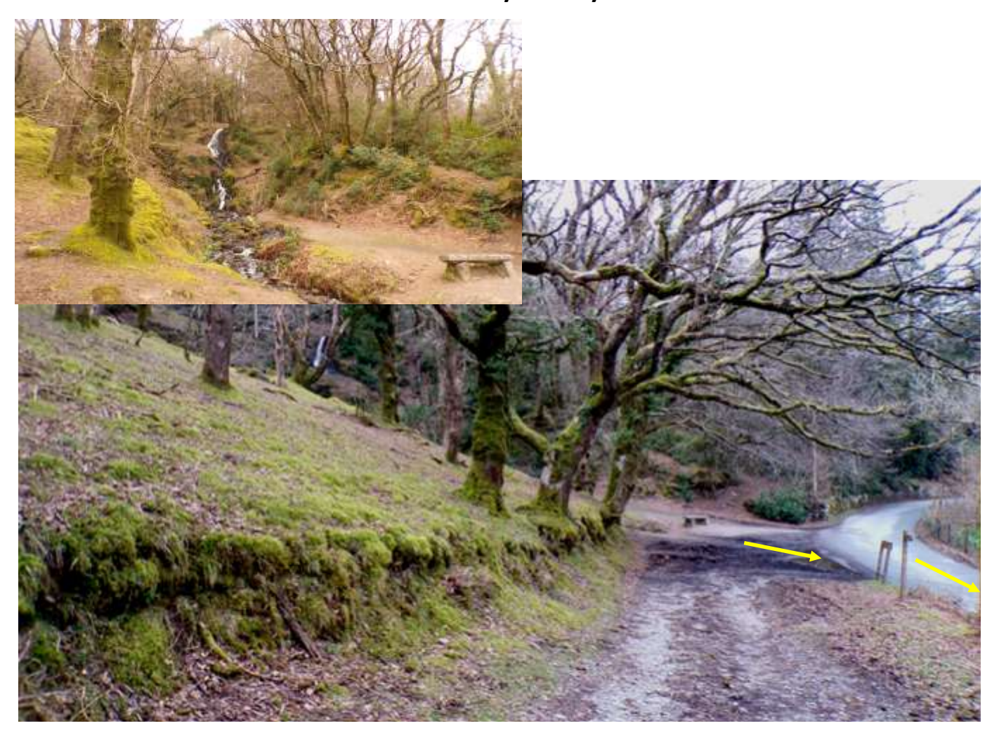
Turn right when you reach the road, perhaps pausing to photograph the waterfall, and walk back to the dam.