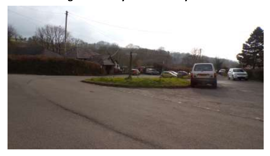
Cross over the road and with the school on your left walk back to the village green and your car.