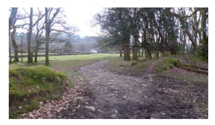
The track will then take you to a field and out to the road via a gate which you absolutely must shut