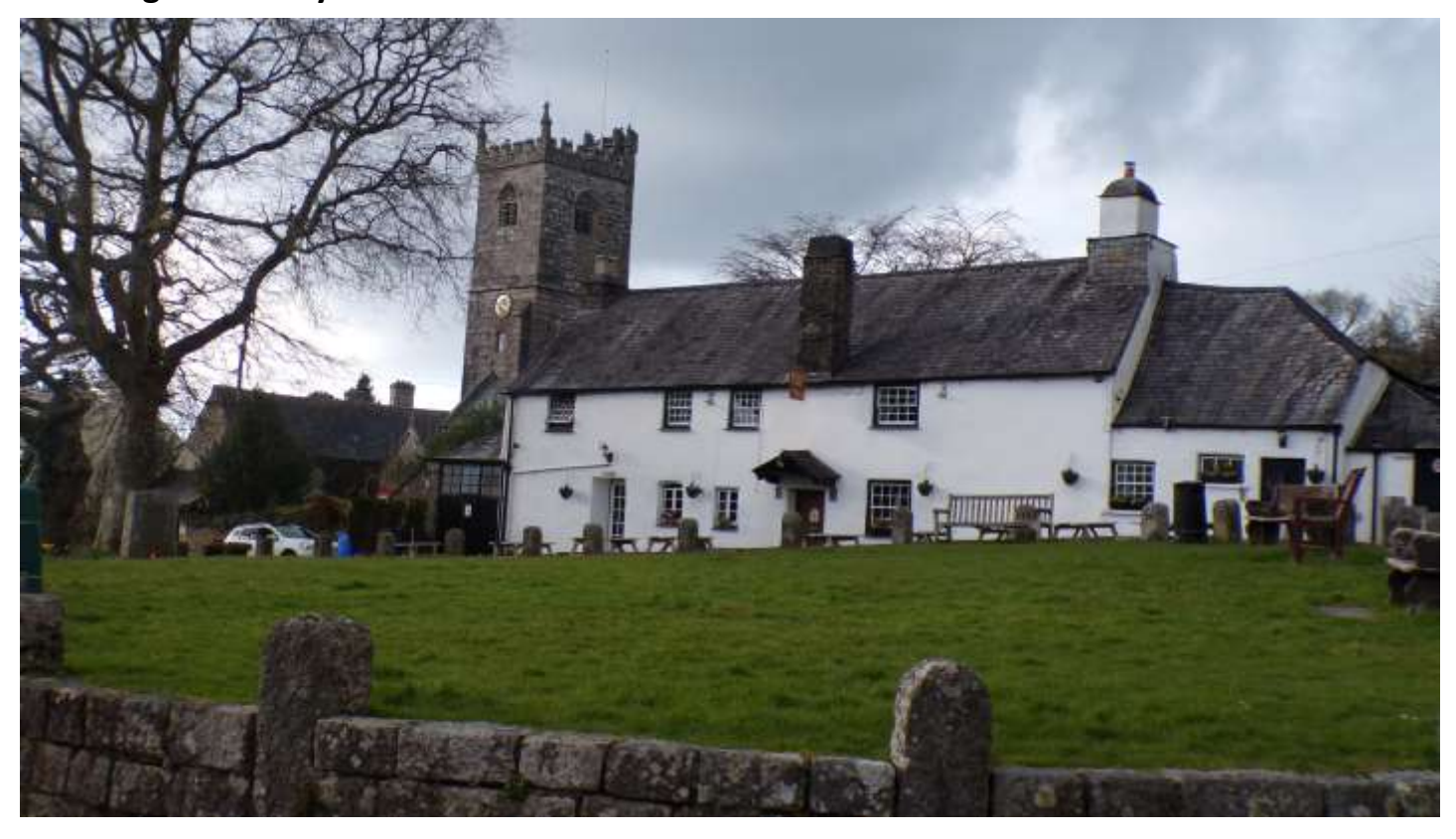
Or perhaps have drink or a meal in the pub before you leave the village