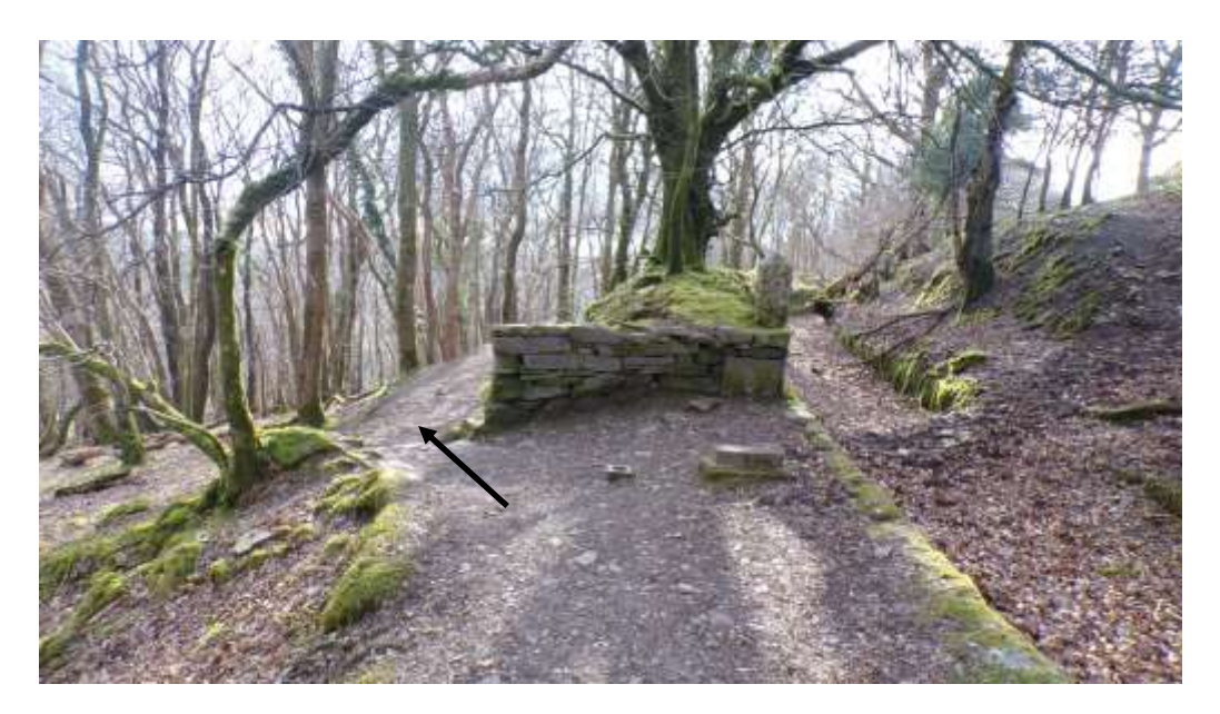
Fork left at the wall with poetry etched into the stones.....