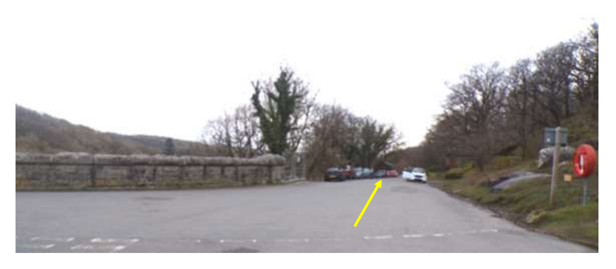
At the dam go straight ahead