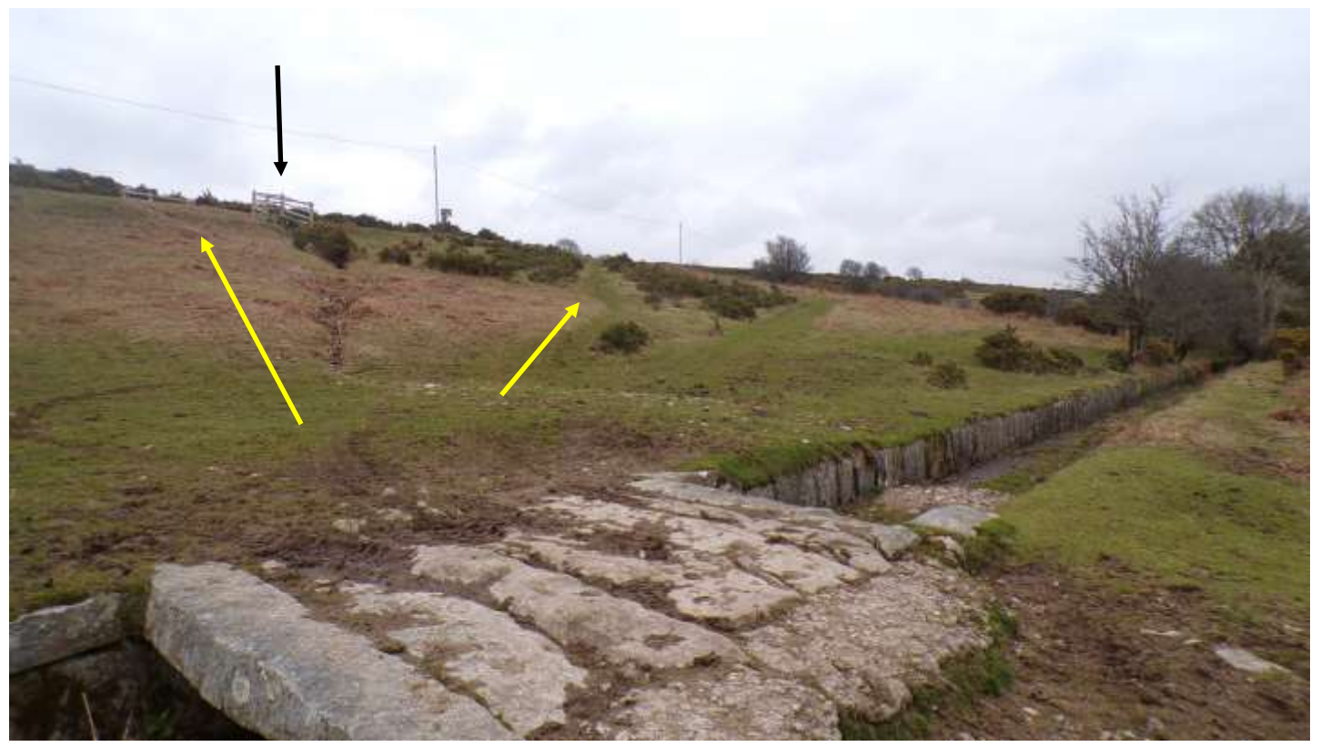
You are now aiming to get up to the road 25m to the left of the railings you can see under the black arrow in the photo. You can either go the steep route or the leisurely route