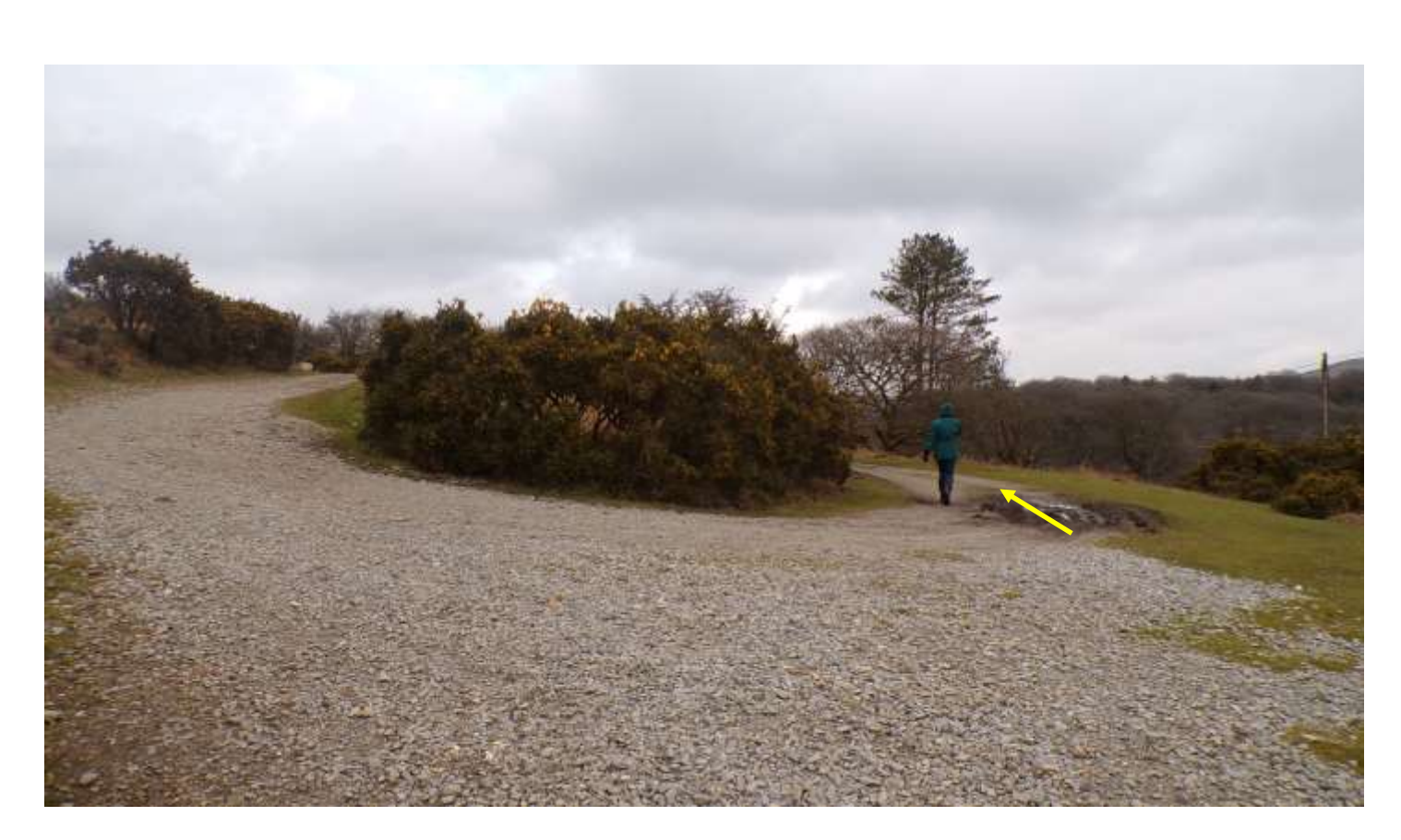
...... follow the track around a tight bend