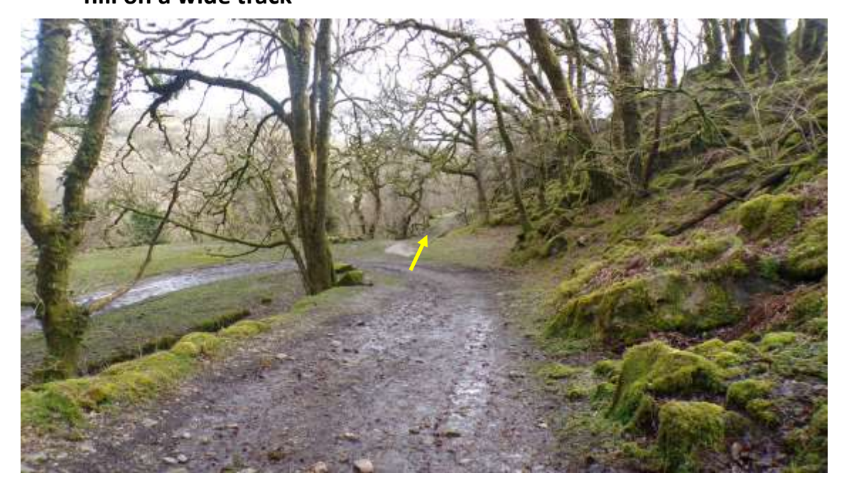
When the track bends sharply left keep going straight ahead with the now dried up Plymouth leat on your right.