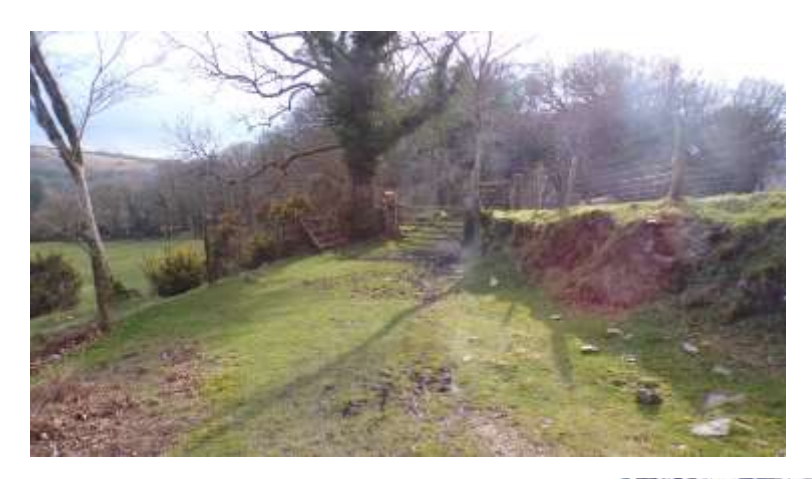
Through two gates ...