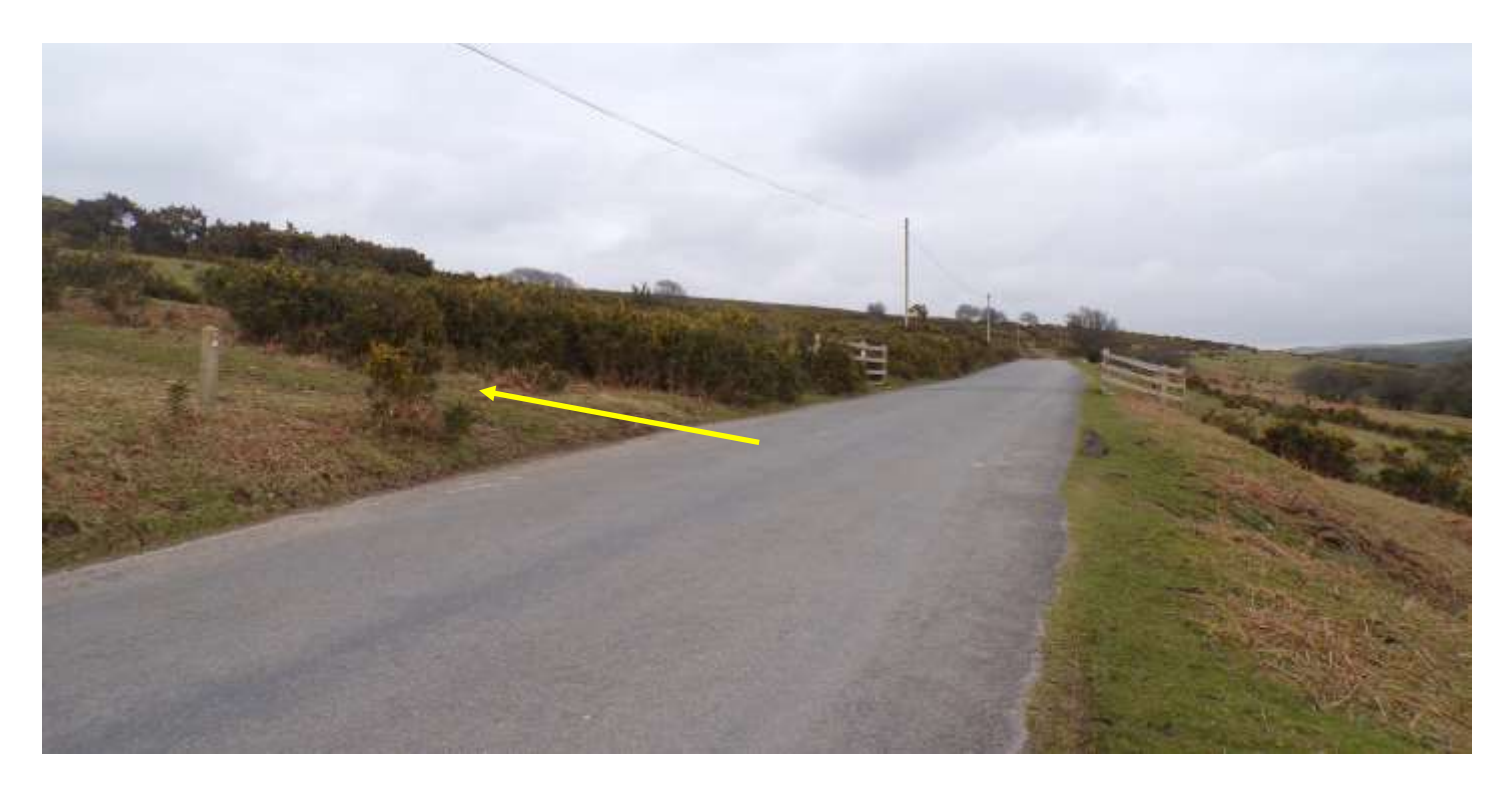
Whichever route you take cross over the road and walk up the grassy track next to a post with a public footpath way marker on it.