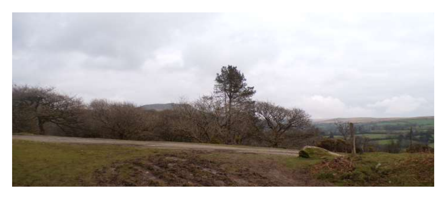
When you arrive at a junction with another track turn right and almost immediately .....