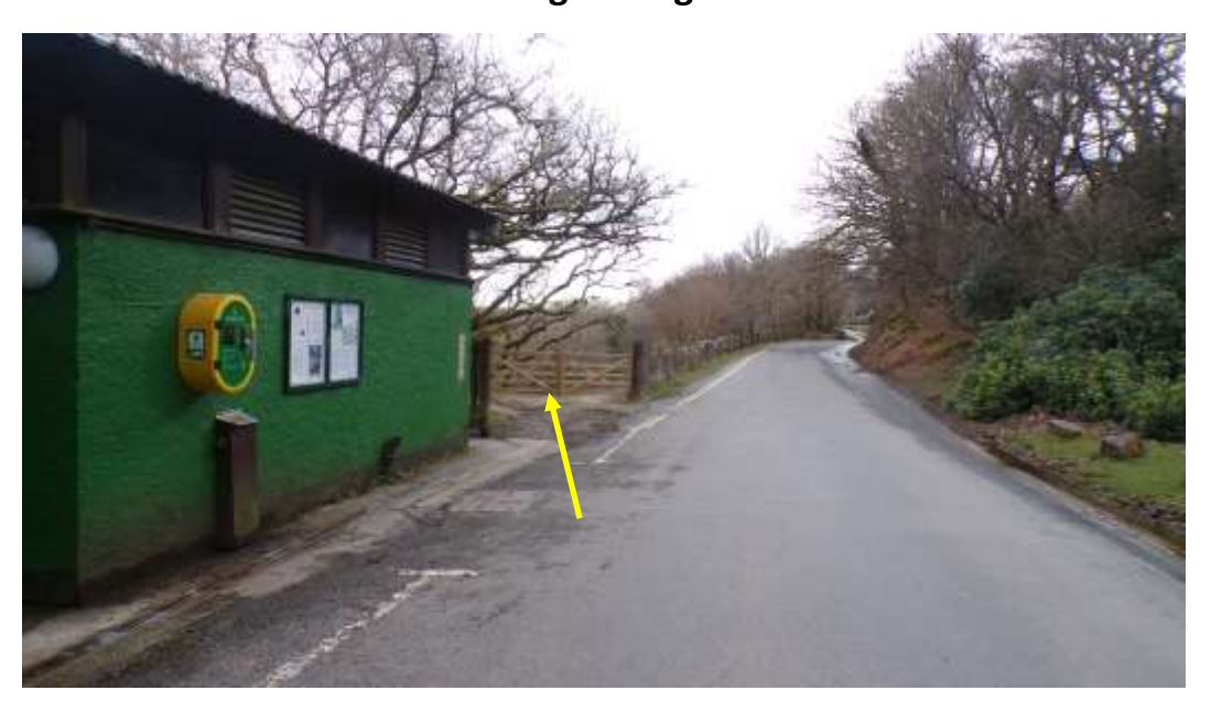
Just past the public toilets fork left and walk steeply down hill on a wide track