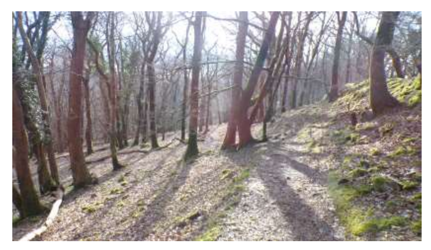
....and follow the well worn path down through the wood