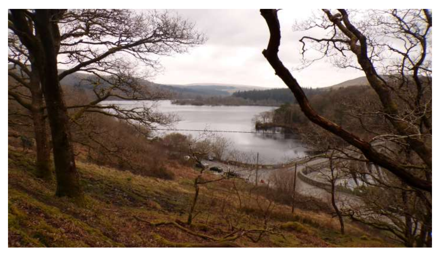
Follow this track all the way to the road passing this fine view of Burrator reservoir on your way