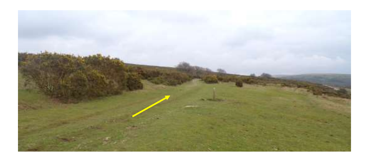
When you reach the disused railway line turn right and follow it....