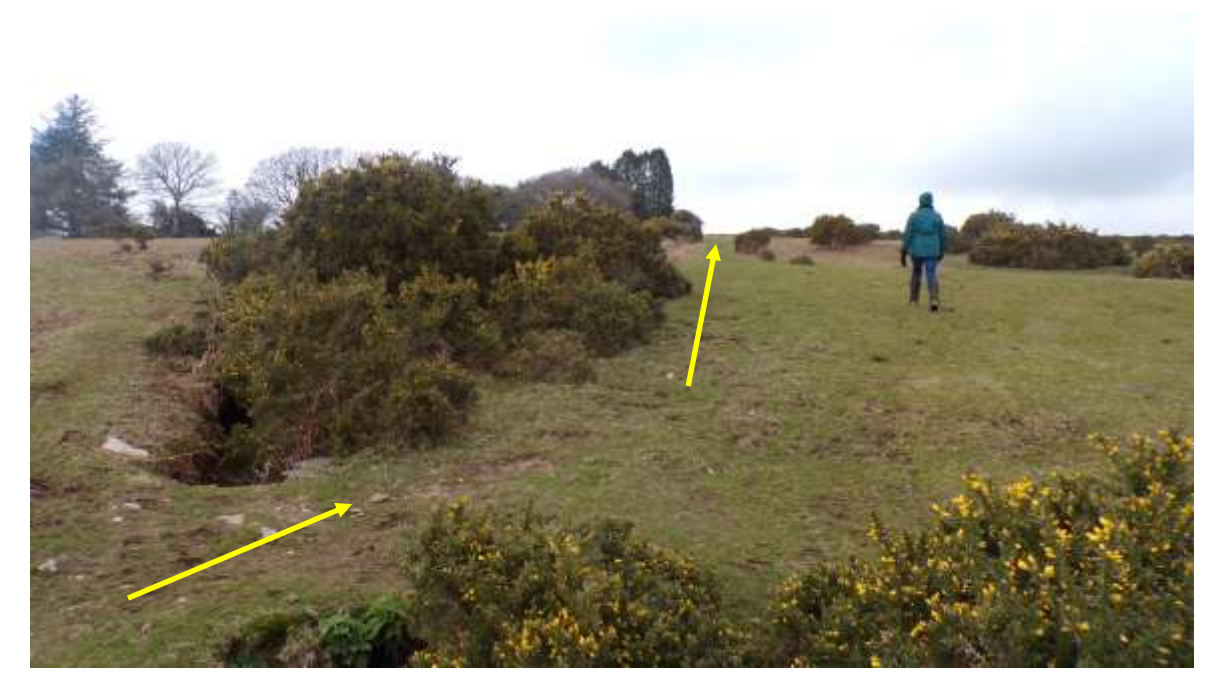
The path quickly crosses a deep gulley and continues up hill