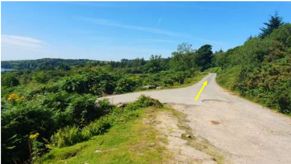
When you reach the road ( which is not the reservoir perimeter road) turn right and walk along the road for about 50m.