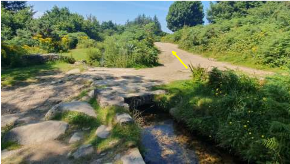
Go over Devonport Leat and keep left