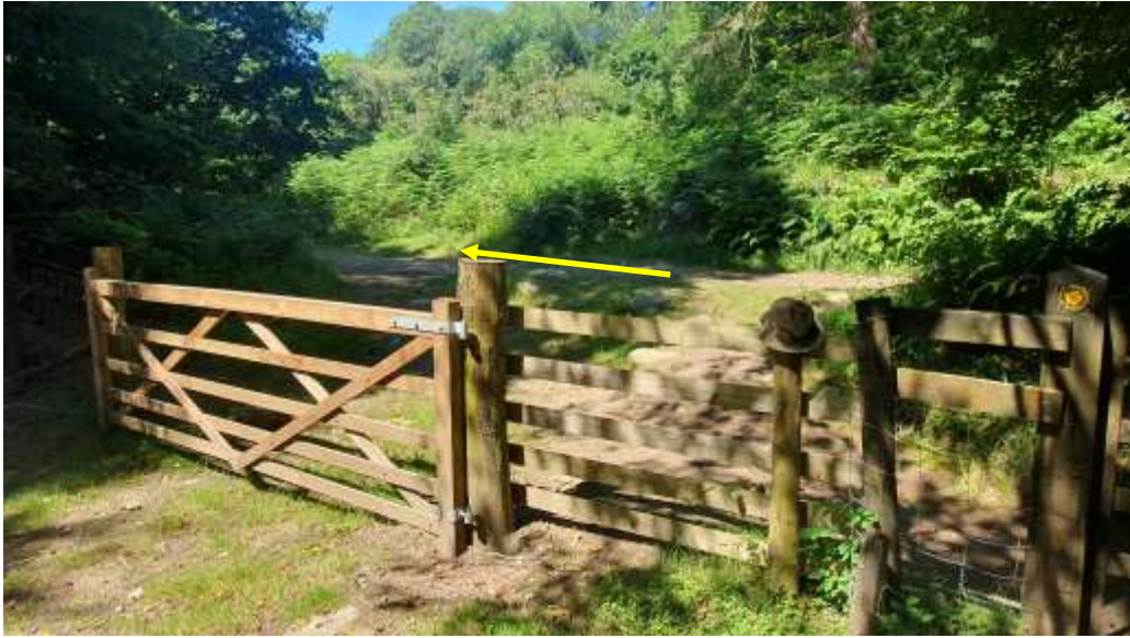
At the top of the hill go through the gate and turn left