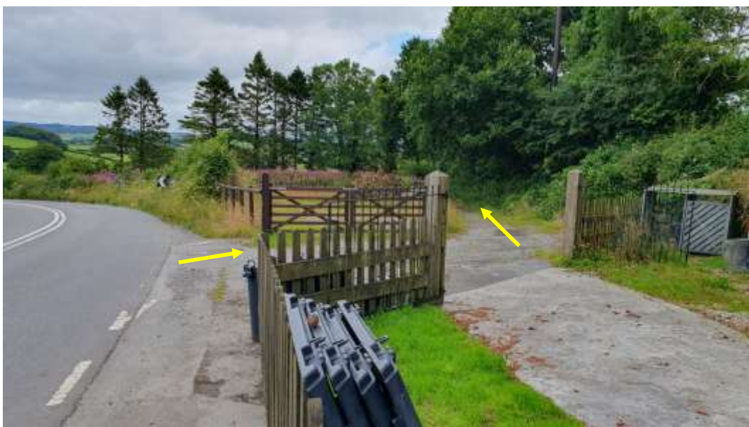
You are going to walk back to Tavistock so turn around and face down hill and walk into what was originally the pub car park. Take the path that leads down the hill.