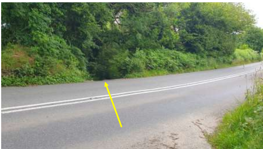
When you reach the road go straight across. There is good visibility both ways