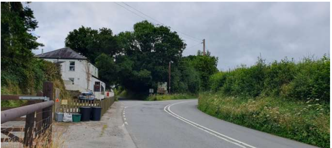
This is the Harvest Home stop. The house on the left used to be a pub called the Harvest Home.