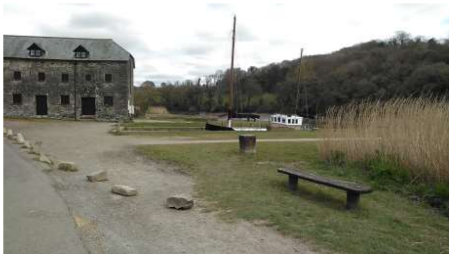
soon arriving at Cotehele Quay