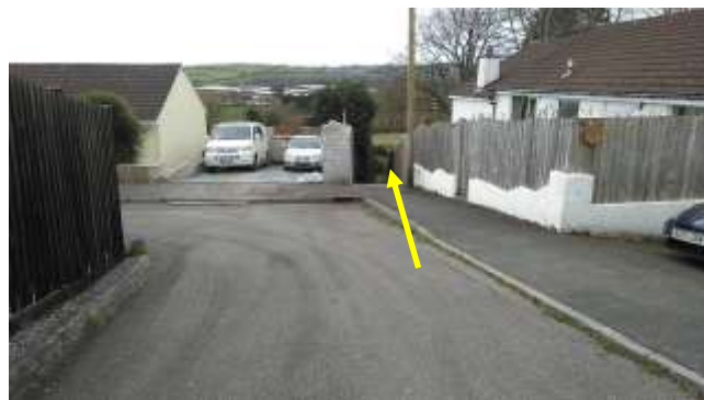
walk between a fence and a hedge