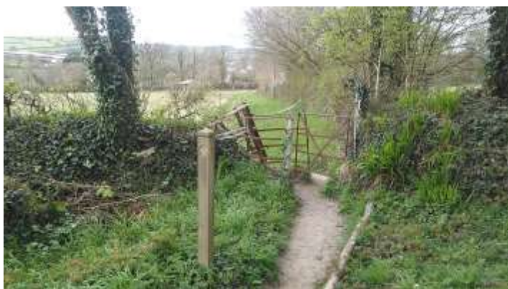
through a gate and along the edge of a paddock.