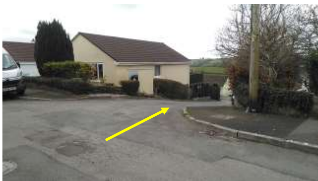
In Nichols Meadow take the first right turn

At the end of this short road turn right then in about 120m turn left into a small estate of mainly bungalows called Nichols Meadow.