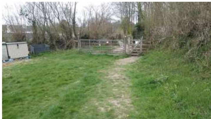
On the other side of the paddock go through the gate and down the vehicle track for another 50m.