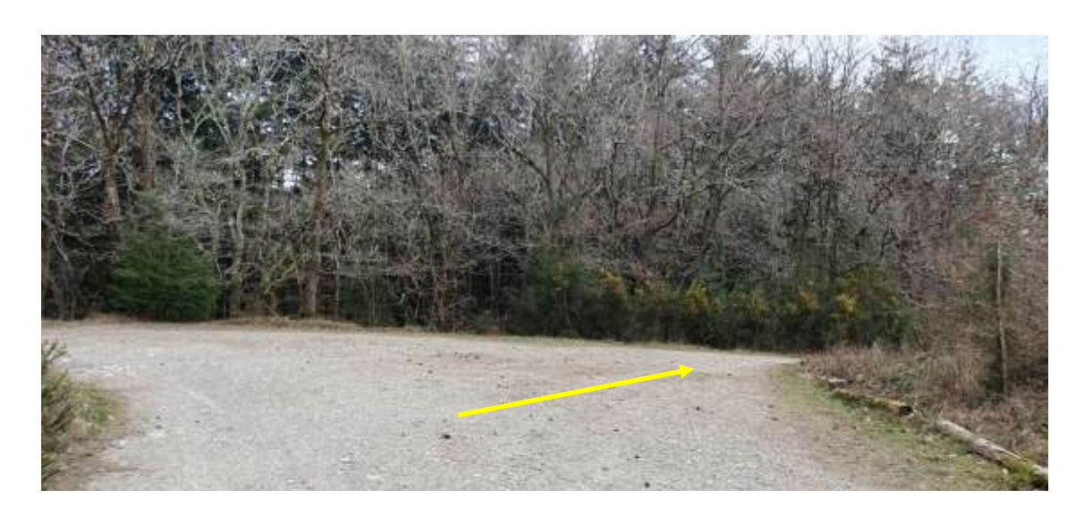
After about 400m the main track bends sharply left . Here turn right