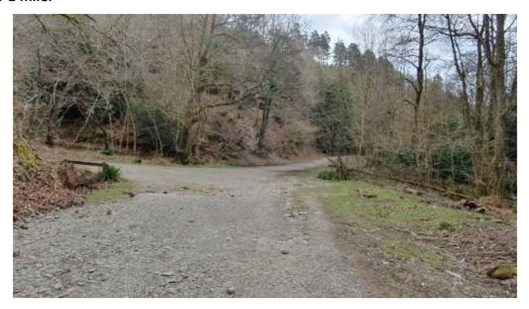
START OF DIVERSION

Walk back towards Plymouth from the Plymouth bound bus stop for about 30m then take the track on your left that was once gated. Stay on the track that leads <u>downhill</u> for just over 1 mile.