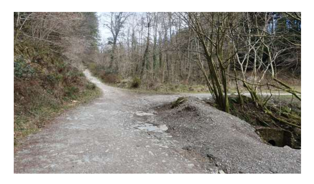
Keep following the wide track as it bends sharply right.