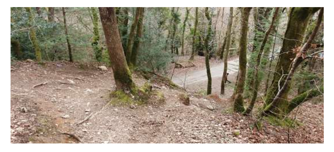
Soon the path drops steeply down to the cycle track. It is quite steep so take care AND TAKE SMALL STEPS. On reaching the cycle track turn right walk over the viaduct and keep going.