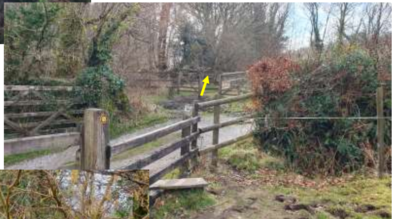
Cross over a driveway