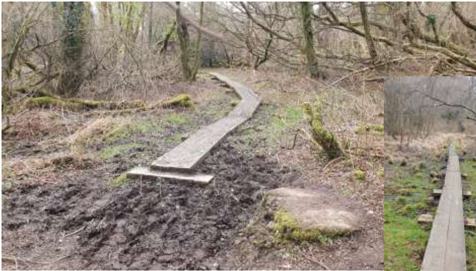
You will walk a very long Board walk