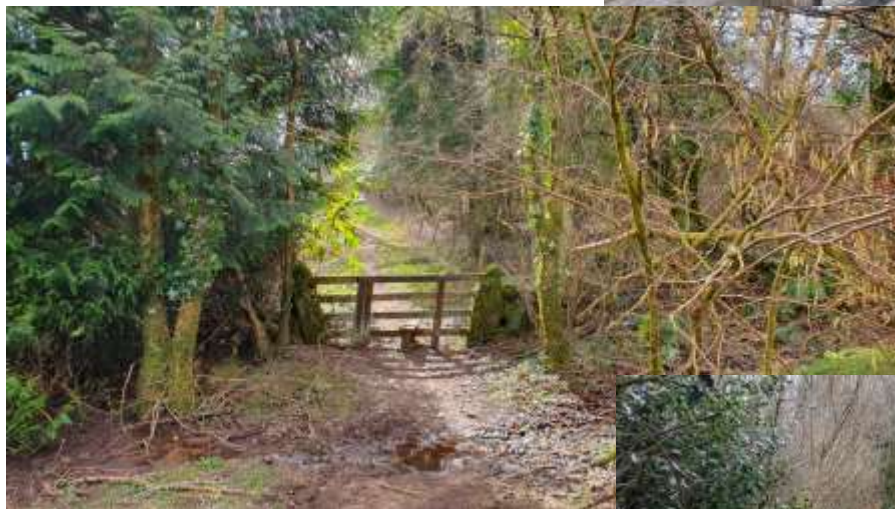
Climb over yet another stile