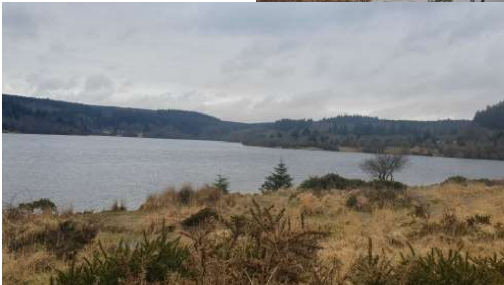
View of the water

Just before you reach the dam look out for this well preserved prehistoric burial cist on your left close to the waters edge.