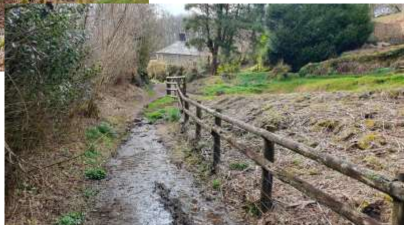
Walk up a stream which is not a bad as it sounds.