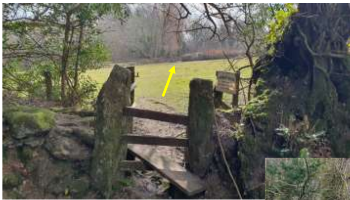
Go over a stile and cross a field