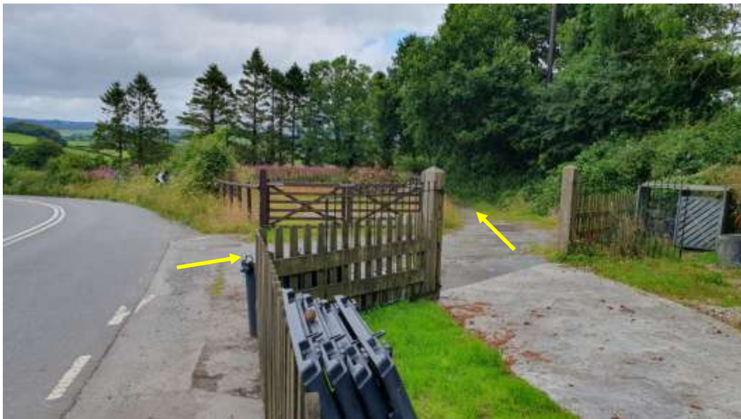
You are going to walk back to Tavistock so turn around and face down hill and walk into what was originally the pub car park. Take the path that leads down the hill.