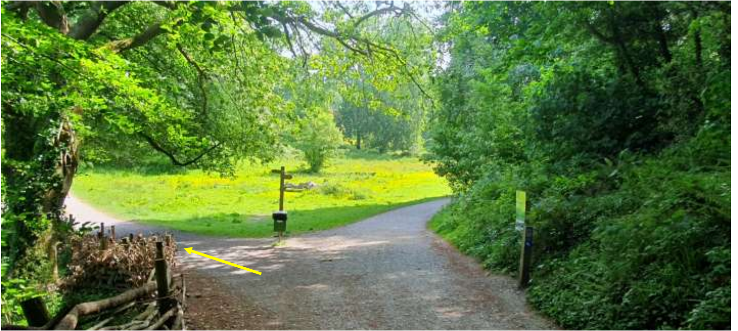
At the Y junction fork left

When you reach the next junction continue straight ahead but first make a short excursion down to another view of the river.